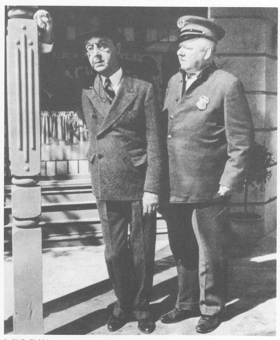
In W.C. Fields' movie, "The Bank Dick," stalwart bank examiner J. Pinkerton Snoopington overcame numerous diversionary shenanigans by guard Egbert Sousé. "I would go into tse-tse fly country if there were books to be examined," he asserted.