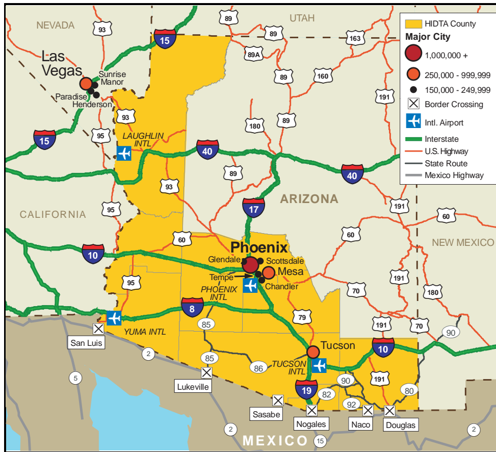
Figure 3. Arizona HIDTA transportation infrastructure.

smaller loads (20 to 100 kg) than they had transported previously, particularly when smuggling cocaine, most likely to cut their losses in the event of law enforcement interdiction. Smaller drug loads typically are stored in stash houses in the Nogales area for consolidation and eventual bulk transport to Tucson and Phoenix. Once in Tucson and Phoenix, some of the drugs are distributed locally; however, significant quantities are repackaged and shipped to other U.S. destinations, including Colorado, Georgia, Indiana, Kansas, Kentucky, Missouri, Nebraska, Ohio, Utah, and Wisconsin. Most drug proceeds are transported in the reverse direction, often in the same vehicles used to transport illicit drugs to the area.