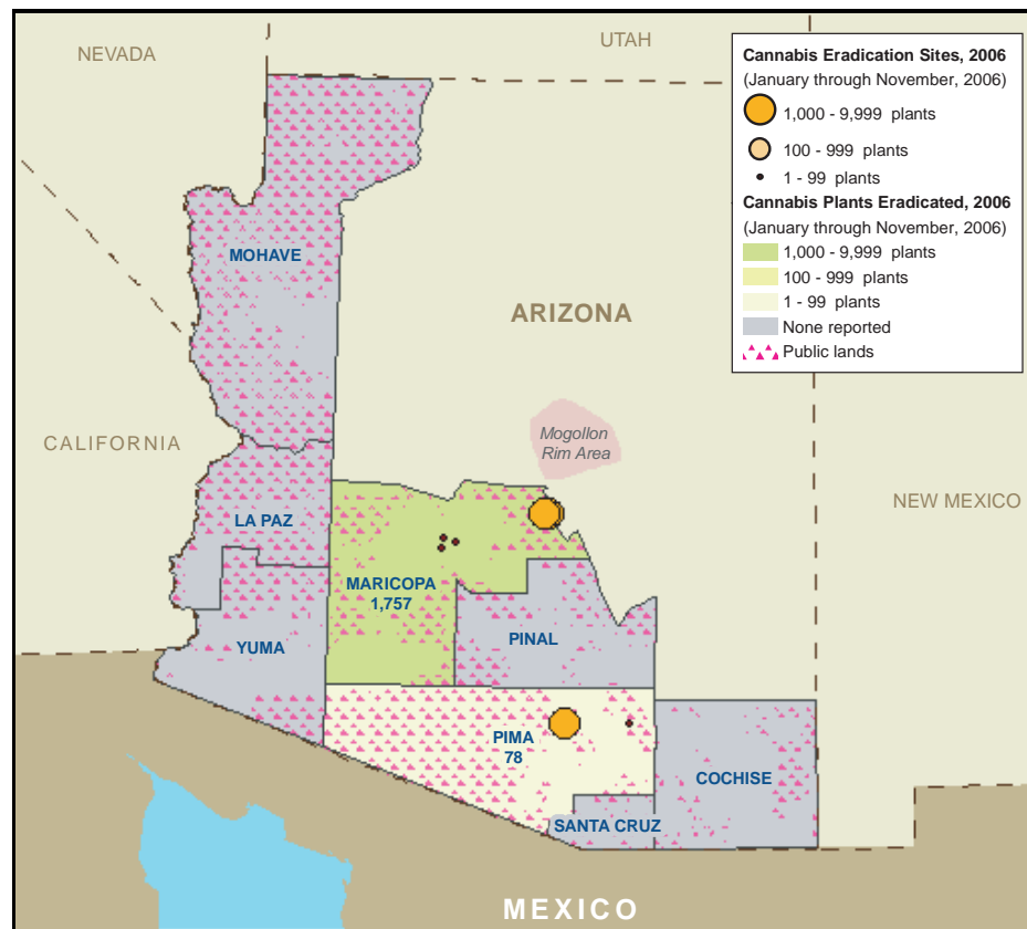
Figure 2. Cannabis eradication sites in the Arizona HIDTA region, 2006.