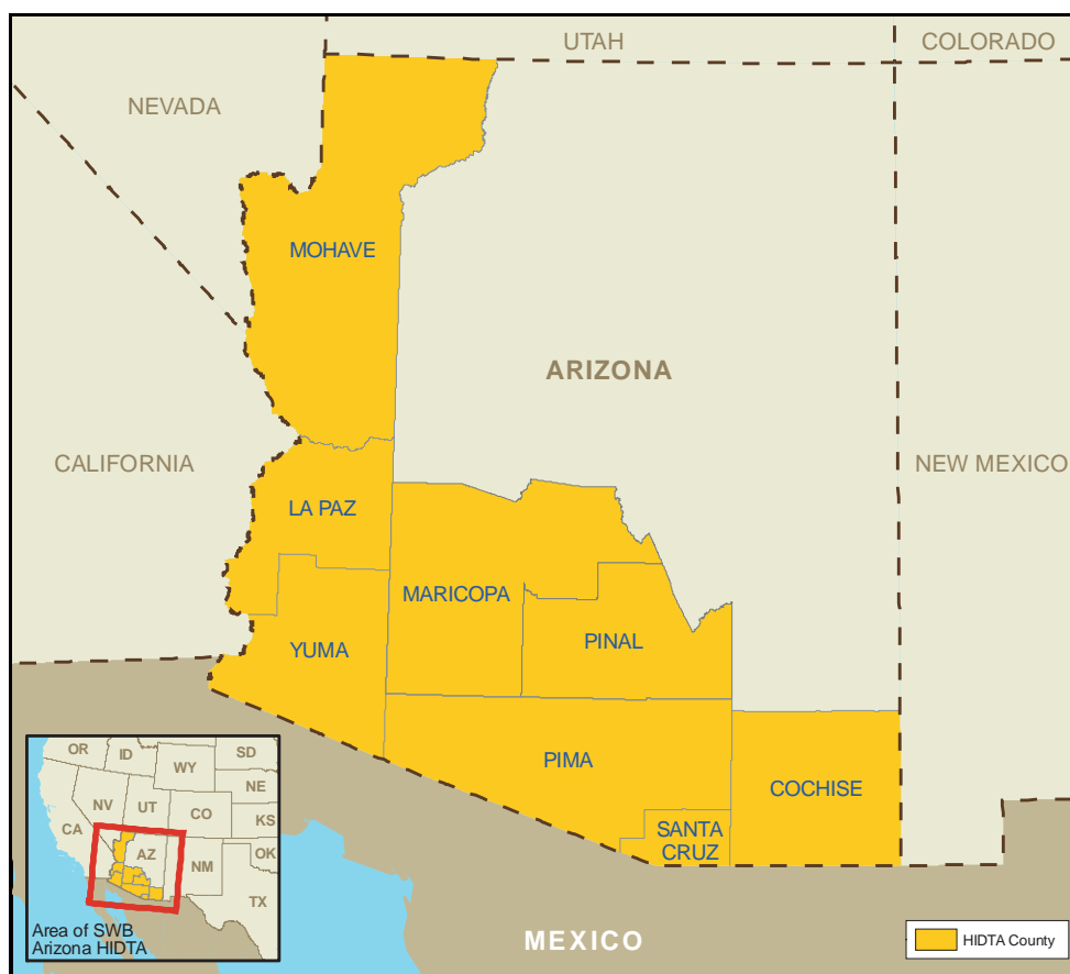
Figure 1. Counties in the Arizona High Intensity Drug Trafficking Area.

reporting, information obtained through interviews with law enforcement and public health officials, and available statistical data. The report is designed to provide policymakers, resource planners, and law enforcement officials with a focused discussion of key drug issues and developments facing the Arizona HIDTA.