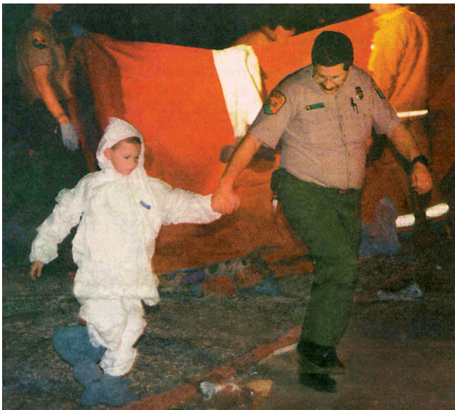
A 5-year-old boy had to be decontaminated when police found a clandestine methamphetamine laboratory in his Palm Springs home in November 1999. Riverside County Fire Department/California Department of Forestry Capt. Larry Katuls leads the boy, wearing a protective suit, to a police car.

An increasing number of children in the United States are exposed to toxic chemicals because methamphetamine laboratories are being operated in or near their homes. In addition, these children often are abused or neglected by the parents, guardians, or others who operate these laboratories. The number of children found at seized methamphetamine laboratory sites in the United States more than doubled from 1999 through 2001.