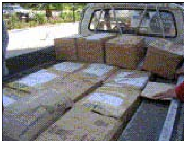
Textbook delivery to northern Iraqi universities