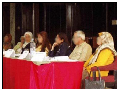
Iraq participants in a bank training seminar held earlier this year