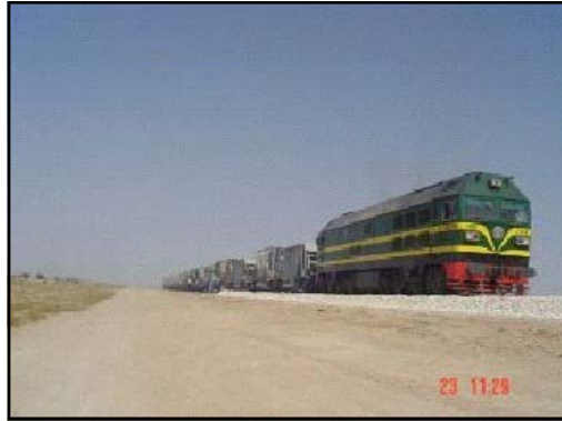
An IRR train loaded with ballast wagons destined for project sites in southern Iraq