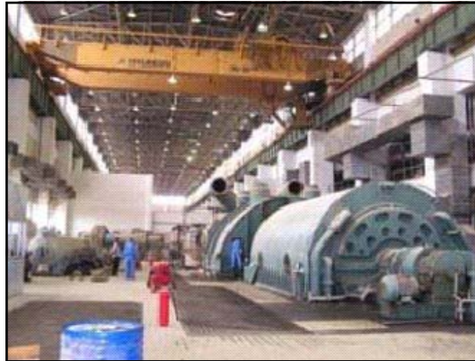
USAID's project to improve electrical generation at this Babil Governorate power plant is more than one-third complete