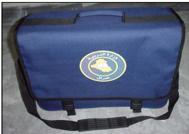
These bags containing school supplies will be distributed to 500,000 secondary school students under USAID's Year 2 Basic Education program