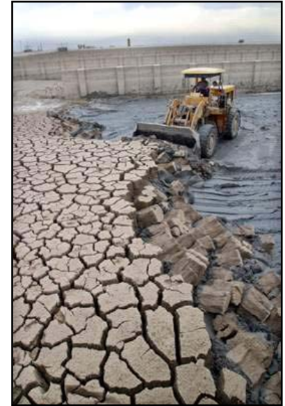
Loaders remove accumulated silt from a settling reservoir.