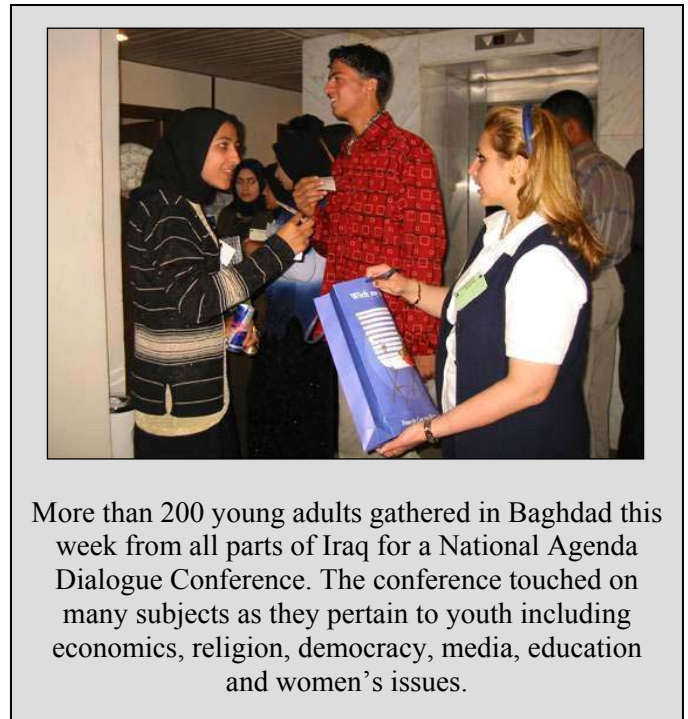
More than 200 young adults gathered in Baghdad this week from all parts of Iraq for a National Agenda Dialogue Conference. The conference touched on many subjects as they pertain to youth including economics, religion, democracy, media, education and women’s issues.