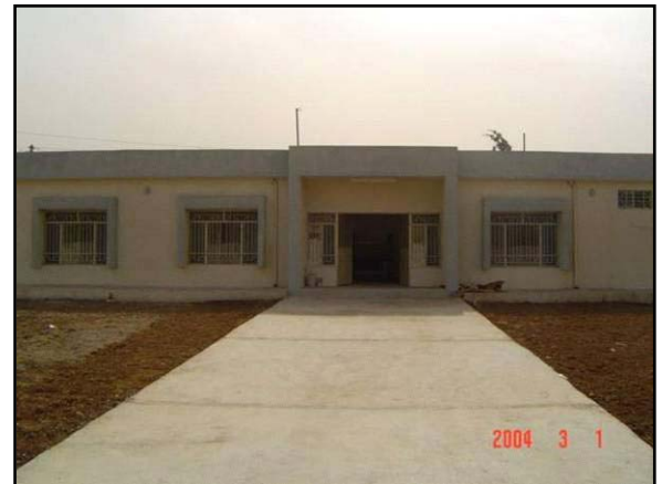
Newly renovated Basta Piazza Children's Center in Arbil.