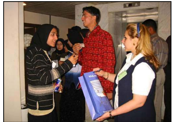
Youth conference participants preparing for a presentation.