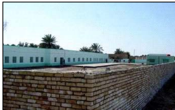
AL-Ashbal School in Bada'at Aswad in Karbala' Governorate (after).