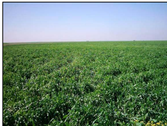
Winter Crop Technology Demonstration using recommended supplemental irrigation.