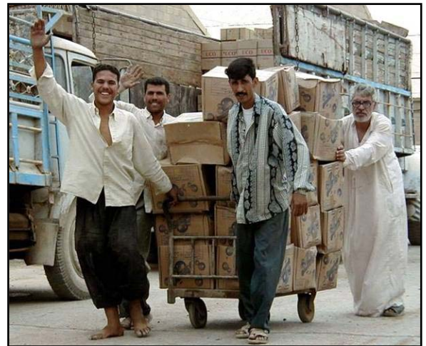
Iraqi food agents from receiving ration commodities from the public food distributions.