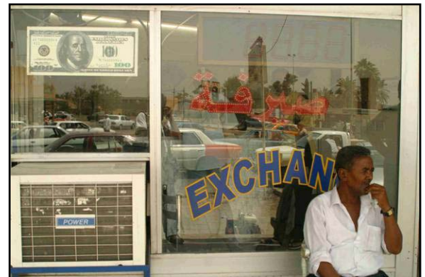
The currency exchange began on October 15 and now all of the 6.36 trillion new Iraqi dinars are in country.