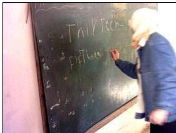
Karbala' Accelerated Learning student Marwa Adnan uses a new chalkboard furnished by USAID.