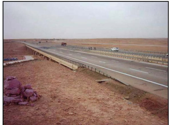
The newly rehabilitated Al Mat Bridge was reopened on March 3.