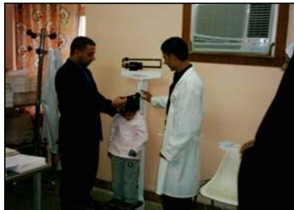
Essential primary health care equipment is being delivered to clinics throughout Iraq.