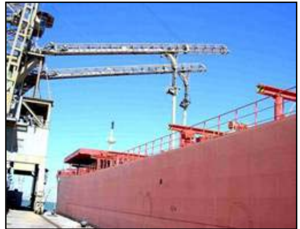
A ship unloads at Umm Qasr grain-receiving facility.

Telecommunications -- Objectives include: installing switches to restore service to 240,000 telephone lines in Baghdad area, and repairing the nation's fiber optic network from north of Mosul through Baghdad and Nasiriyah to Umm Qasr.