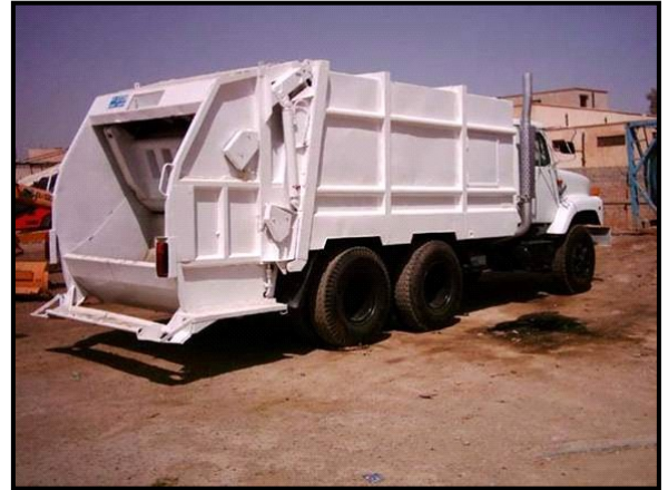
New garbage truck supplied to a Diyala' Governorate municipality to improve solid waste collection