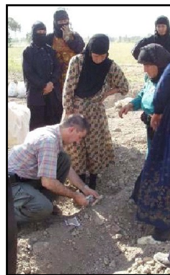
Planting the first plot of hybrid maize seed in the crop demonstrations