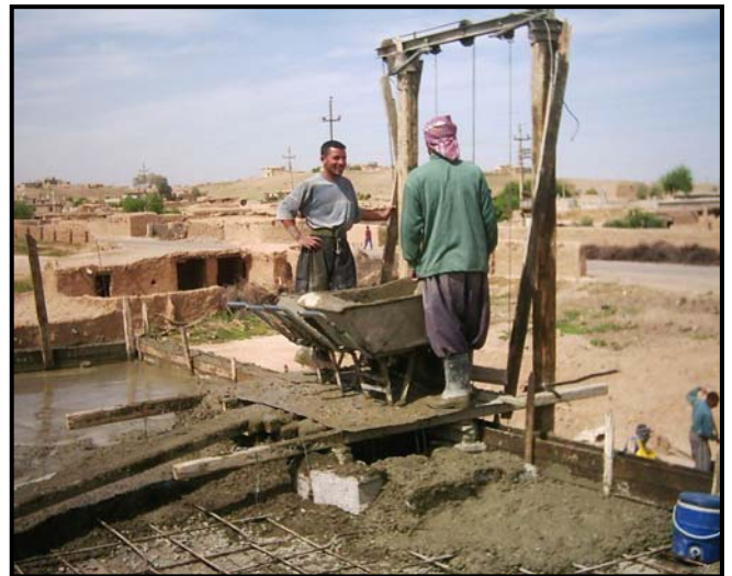
School construction in Sulaymaniah