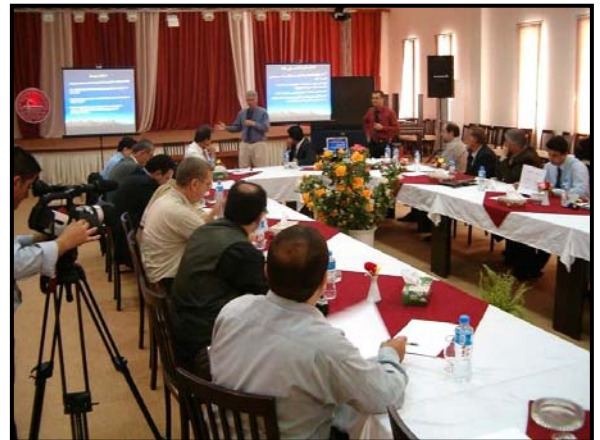
Inaugural meeting of the Kurdistan Tourism Advisory Committee