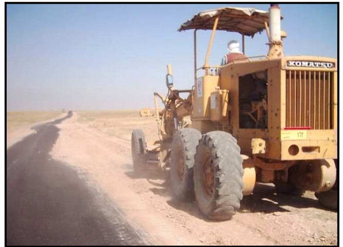
Street paving in Ninawa