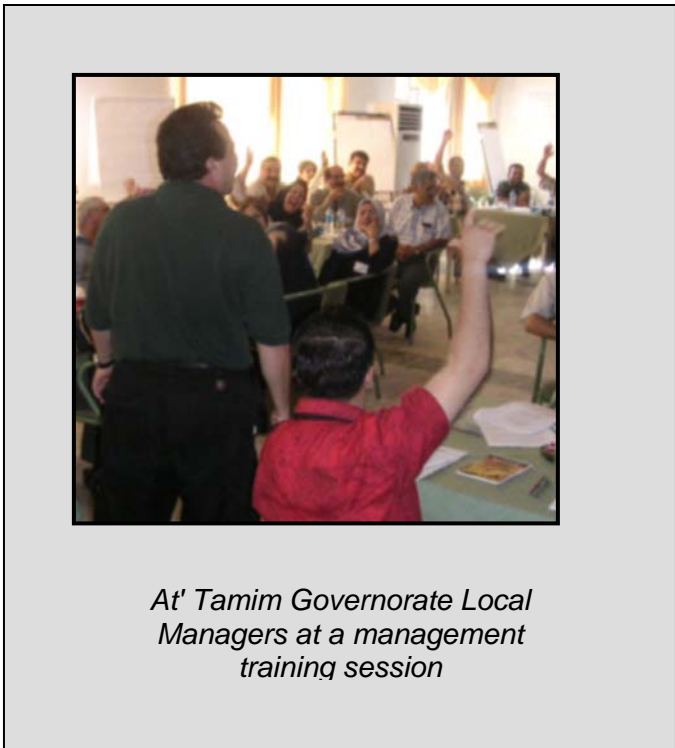
At' Tamim Governorate Local Managers at a management training session