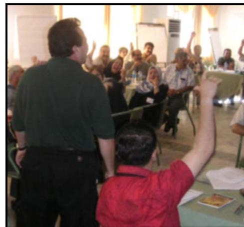
At' Tamim Governorate Local Managers at a management training session