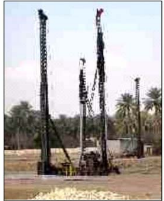
Four pile drivers at the Sharkh Dijlah water treatment plant.