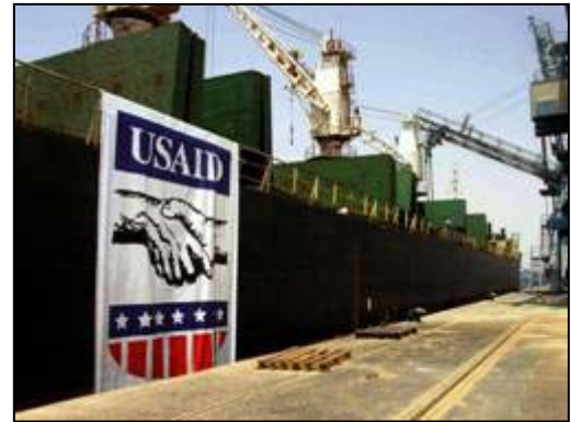
A ship offloads goods at Umm Qasr Port, Iraq's only deep water port.

Telecommunications -- Objectives include: installing switches to restore service to 230,000 telephone lines in Baghdad area; repairing the nation's fiber optic network from north of Mosul through Baghdad and Nasiriyah to Umm Qasr by March 2004.