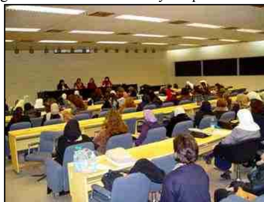
Attendees of the “Constitutional Democracy: Rebuilding Society in a Democratic Age” workshop