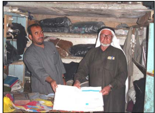
Iraqi food agents record food deliveries and distribute rations to Iraq's 25 million people.

Food Security -- Objectives include: providing oversight support for the countrywide public distribution system, which provides basic food and non-food commodities to 25 million Iraqis; participating in the design of a monetary assistance program to replace the commodity-based distribution system in order to support local production and free-market infrastructure; and promoting comprehensive agriculture reform to optimize private participation in production and wholesale markets.