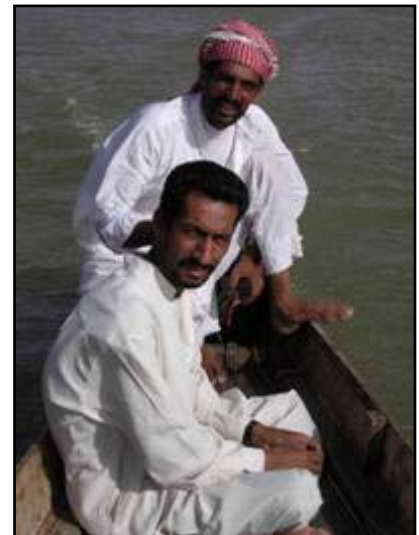
Marsh Arabs in Southern Iraq will benefit from the Marshlands Restoration and Management Program.