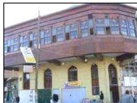
Abu Hanifa Forum before and after renovation