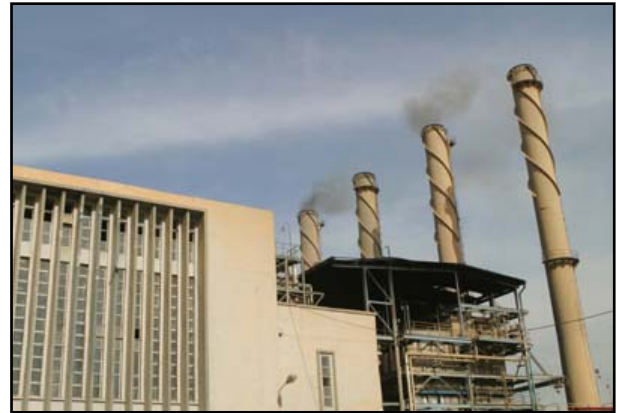
Baghdad's South Power Plant