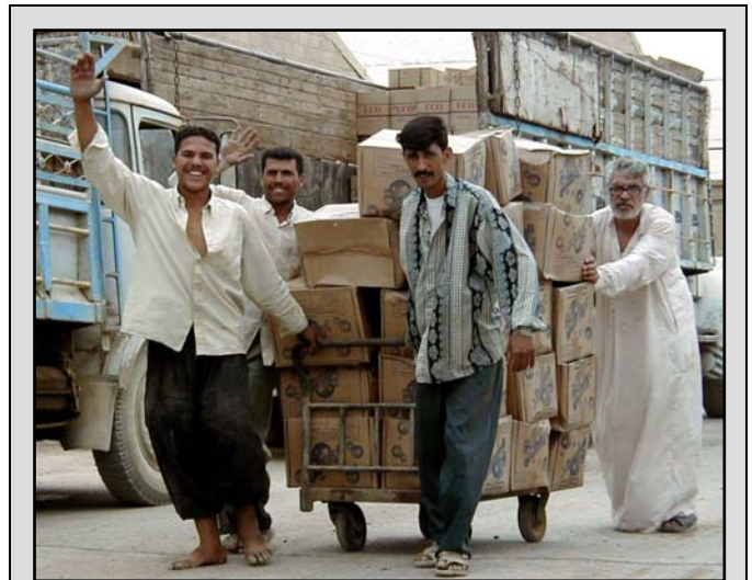
Food ration agents receiving goods through Iraq’s Public Distribution System. The Ministry of Trade distributes 485,000 metric tons of food each month through a ration card system.