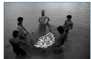
Economic and social development depends on water.