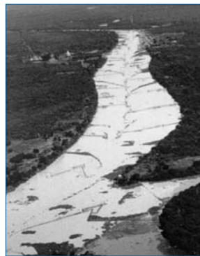
Fishing nets clog a river.

How to move from sectoral management of the resource to a more integrated approach remains a challenge everywhere, including within the Agency. USAID has already had some good results in this area and is continually expanding its toolbox of valuable resources, information, and guidance to support practical, step-wise approaches to enhance integration in both current and new activities.