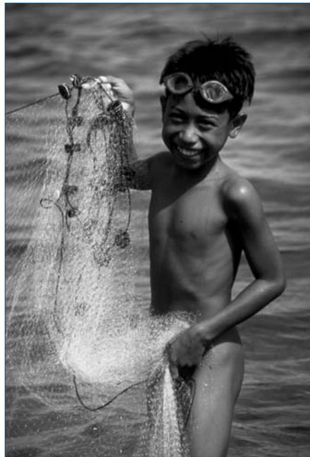
Water and food security are closely intertwined.

mental linkages among them or the enormous ripple effects that can occur upstream and downstream. As we guide our human activities—for all social groups, in all use sectors, and across multiple spatial scales—our challenge is to keep in mind the image of the single Blue Planet as a guiding principle for a more integrated and holistic relationship with fresh and marine water resources. This can inspire creative solutions and can transform our relationship with water in profound and lasting ways.