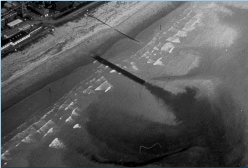
Economic productivity impacts water resources.

Historically, USAID has directed substantial resources toward various aspects of water resources management, reaching a total of at least $11 billion over the last 30 years, and well over $400 million annually in recent years. Many extremely valuable investments have been made to improve access to safe and adequate water supply and sanitation, improve irrigation technology, enhance natural environments, and develop better institutional capacity for water resources management in countries around the world. The way in which these programs have been designed and implemented has often been along traditional sectoral lines: agriculture/irrigation, public health/water supply and sanitation, urban development, economic development, habitat protection and biodiversity. While integration has certainly occurred in specific cases, it is only in recent years that the Agency has explicitly attempted to build bridges across different sectors working in the area of water resources management. A practicable form of IWRM is being promoted to permit synergies and achieve more effective, efficient, and lasting outcomes. In short, USAID is striving to become more strategic in how it manages its investment in the area of water resources management.