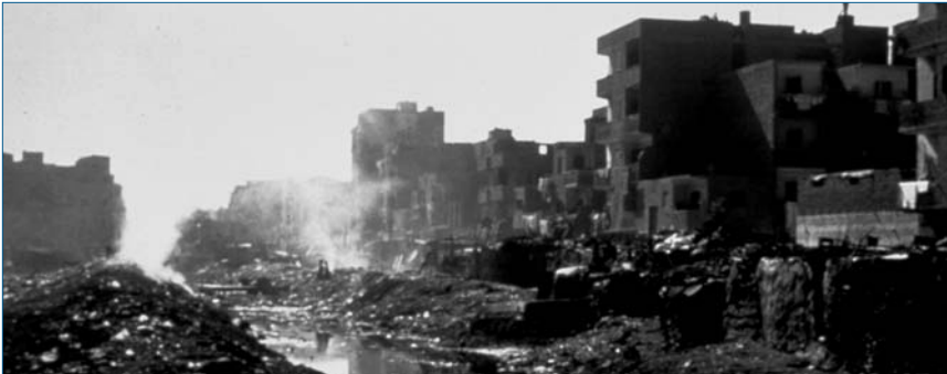
An urban slum lacking adequate environmental infrastructure.