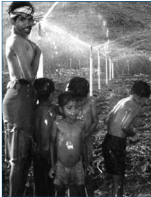
Water impacts people's daily lives in a myriad of ways.

S OMEWHERE on earth, a mother awakens before dawn to collect water, prepare breakfast, and begin the day's chores. A thousand miles away, a textile factory churns out the day's production, and hundreds of workers come and go from the informal settlements where they live. Elsewhere, a farmer tills her field and hopes for rain, while another opens an irrigation valve to water his thirsty crops. A hotel developer plans a new beach resort as the village fisherman prepares his nets for the day's catch. Each day around the world, millions of such individuals, families, and businesses engage in myriad acts of water resources use and management, with a mixed set of outcomes for the planet and each other.