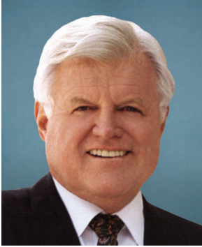
Sen. Edward M. Kennedy of Barnstable Democrat—Nov. 7, 1962