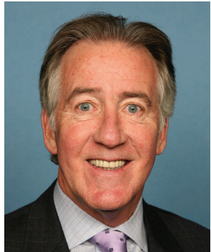
Rep. Richard E. Neal of Springfield (2d District) Democrat—11 terms