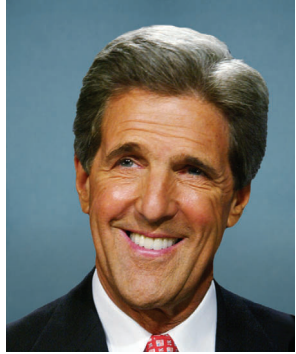
Sen. John F. Kerry of Boston Democrat—Jan. 2, 1985