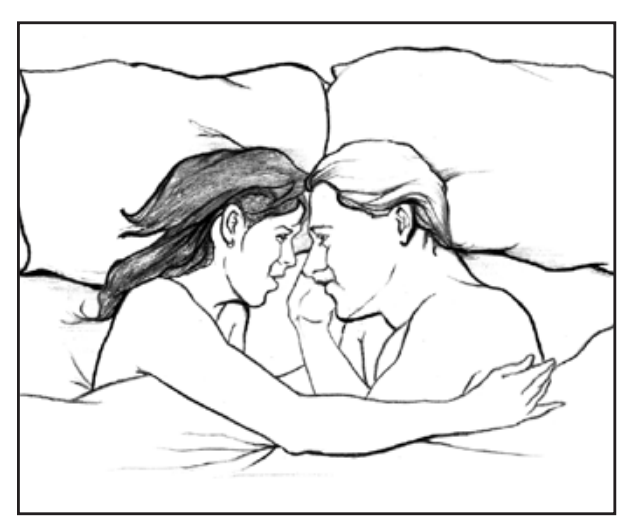
You could get hepatitis B from having sex with an infected person.