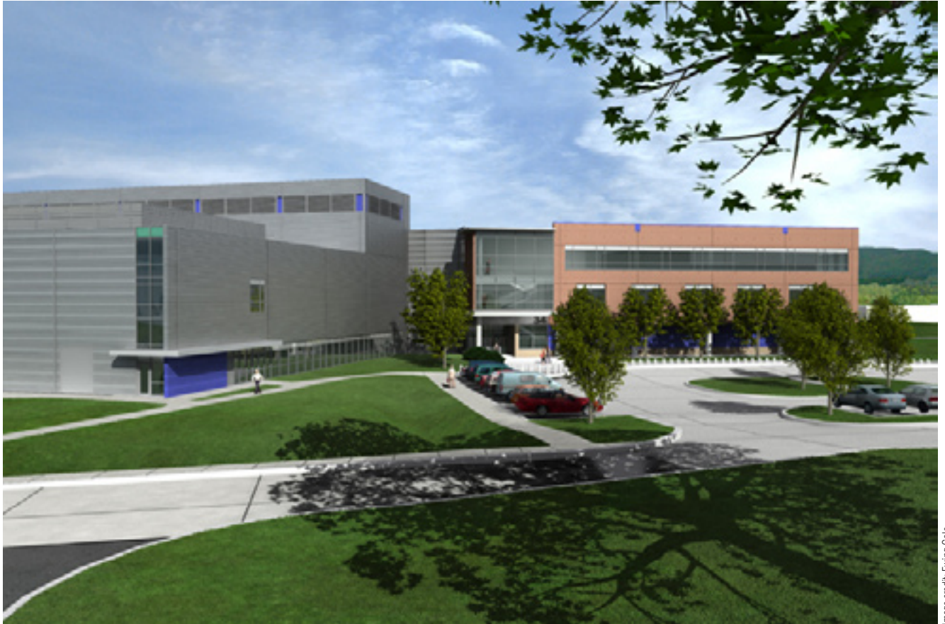
Caption: This artist's rendering depicts how NASA Goddard's new Exploration Sciences Building will look when completed.