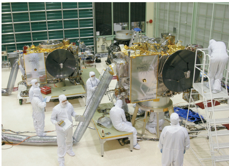
Caption: STEREO spacecraft rest side-by-side in the Goddard cleanroom.

Solar flares and CMEs are the most powerful explosions in the solar system, with the potential to blast billions of tons of plasma into space at a million miles per hour. These events are extremely hazardous to astronauts when outside of the relatively protected Space Shuttle and International Space Station, or traveling out to the moon or Mars. ■