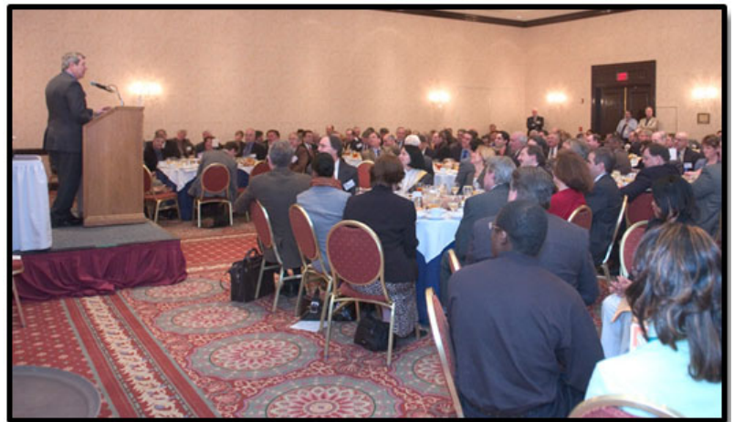
Malay addresses more than 200 attendees.