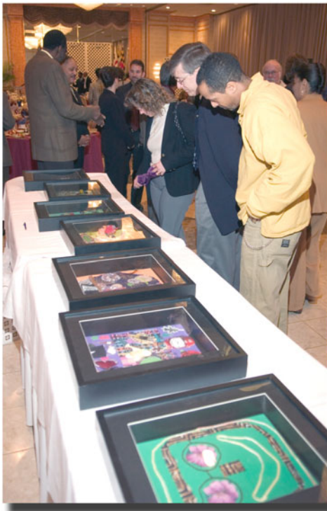
Attendees viewed ALP graduates artistic expression of leadership

The 24-month ALP program provides educational, action learning, mentoring and coaching experiences that will help selected individuals develop competencies and skills more rapidly than they might otherwise develop without participation in ALP.