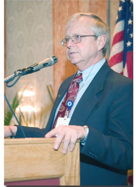
The need for good leaders and continued support for the ALP, Weiler said at the ceremony.