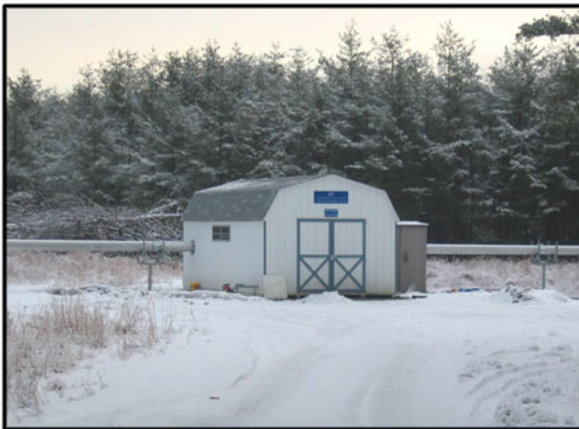
View of middle (optics) building. The source building is about 150 m (450 feet) to the left along the pipe. The detector building lies about 450 m (1350 feet) down the pipe to the right.