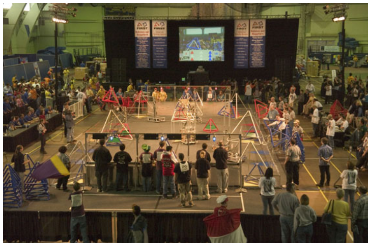
The playing field for 'Triple Play,' the game of the 2005 FIRST Robotics competition.

professionalism, teamwork and mentoring skills that enrich their lives," said Kamen. "Many of our students develop an affinity for their science and math courses, go on to study engineering, technology or science in college, and also to pursue employment opportunities with sponsoring companies," added Kamen.