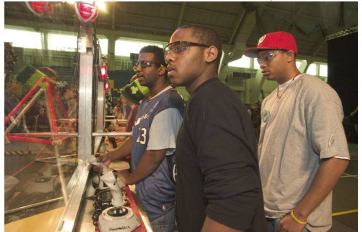
The D.C. team, from Friendship Edison Collegiate Academy, at the controls during a match at the regional competition.

Fifty-five teams competed this year; 30 from across the country, 13 from throughout the state of Maryland, a team from the