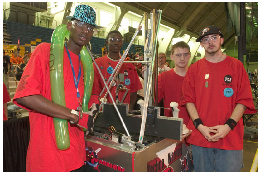
Members of team #768 from Woodland High School, stand with their robot before another competition round.