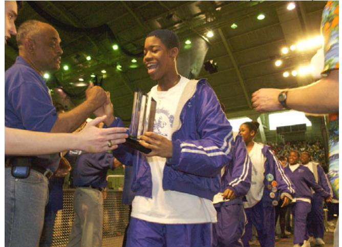
Team #49 from Saginaw, Mich., won the 2005 Team Spirit Award at the Chesapeake Regional.