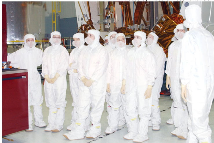
Young women from the Greencastle-Antrim High School are given a tour of the clean room in building 29.

through the air shower and get into the 'Bunny' suits. Then, the young women explored the clean room where Holz showed them the parts of the Hubble Space Telescope (HST) and the testing devices that are housed inside the clean room. They also learned about the extreme clean conditions necessary for such sensitive instruments.