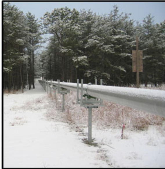
View along pipe towards source building.