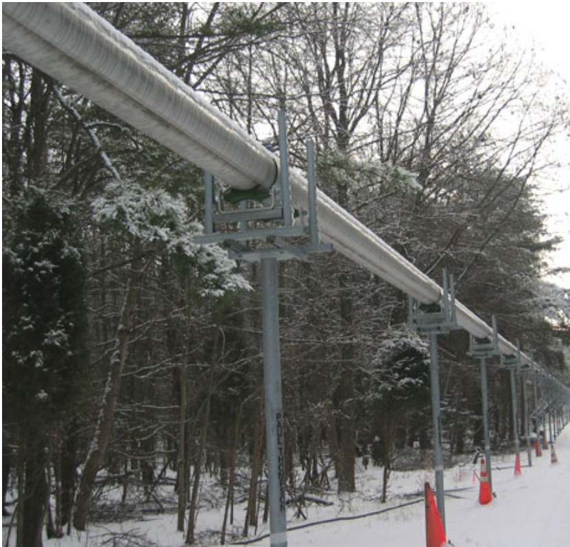
View halfway along the pipe, looking towards the detector building. Note the names visible on the taller supports.

the work, they saved us about $200,000. They worked hard, they did not overcharge us, and they did an excellent job."