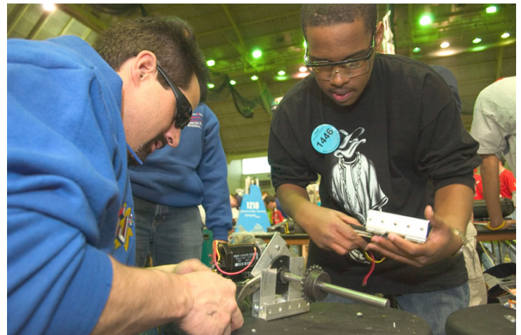
Team #1446, a rookie team from Washington, D.C., were provided hands-on support by members of other teams.