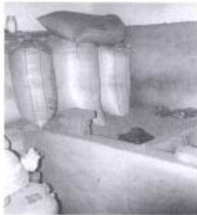
Household grain bin, 2001, Hebei.