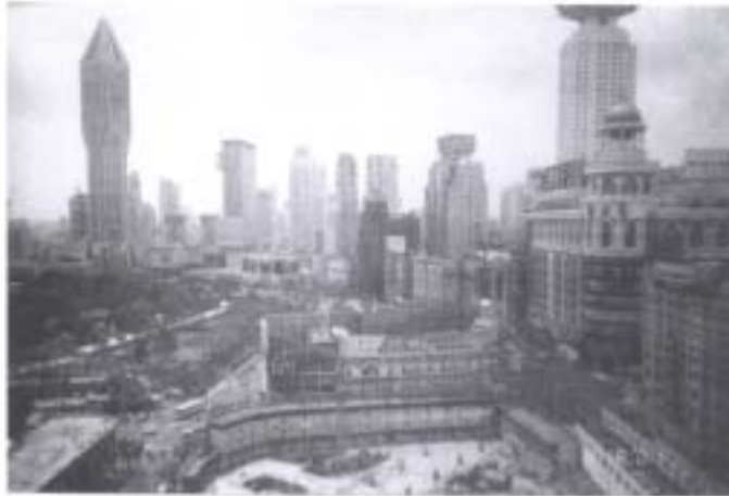
Shanghai skyline, 2001.

Cars Subways Good roads Big stores Stadiums AC Good schools Colleges KFC Internet bars 5 star hotels