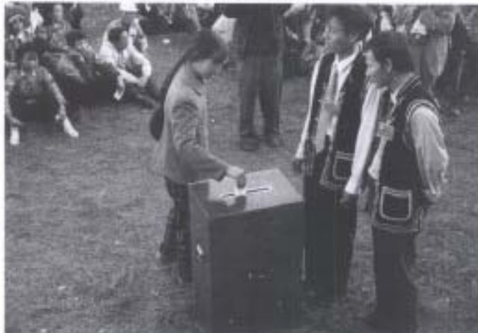
Village election in Yunnan province, December 2002.