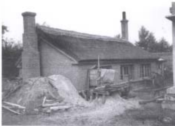
Farm house with attached saw mill, Heilongjiang, 1988.

Bicycles Small buses Poor roads Small stores Few AC in houses Poor schools Few restaurants 2 star hotels Gov't guest houses Limited internet Access.