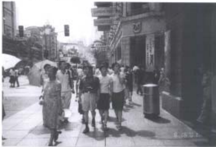
Shoppers in Shanghai, August 2001.