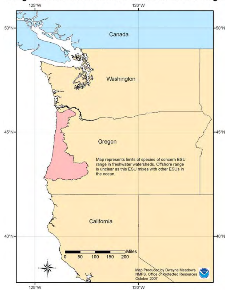
Figure 1. All watersheds which contain the Oregon Coast steelhead trout ESU. Ocean range is unclear as this ESU mixes with other steelhead populations.