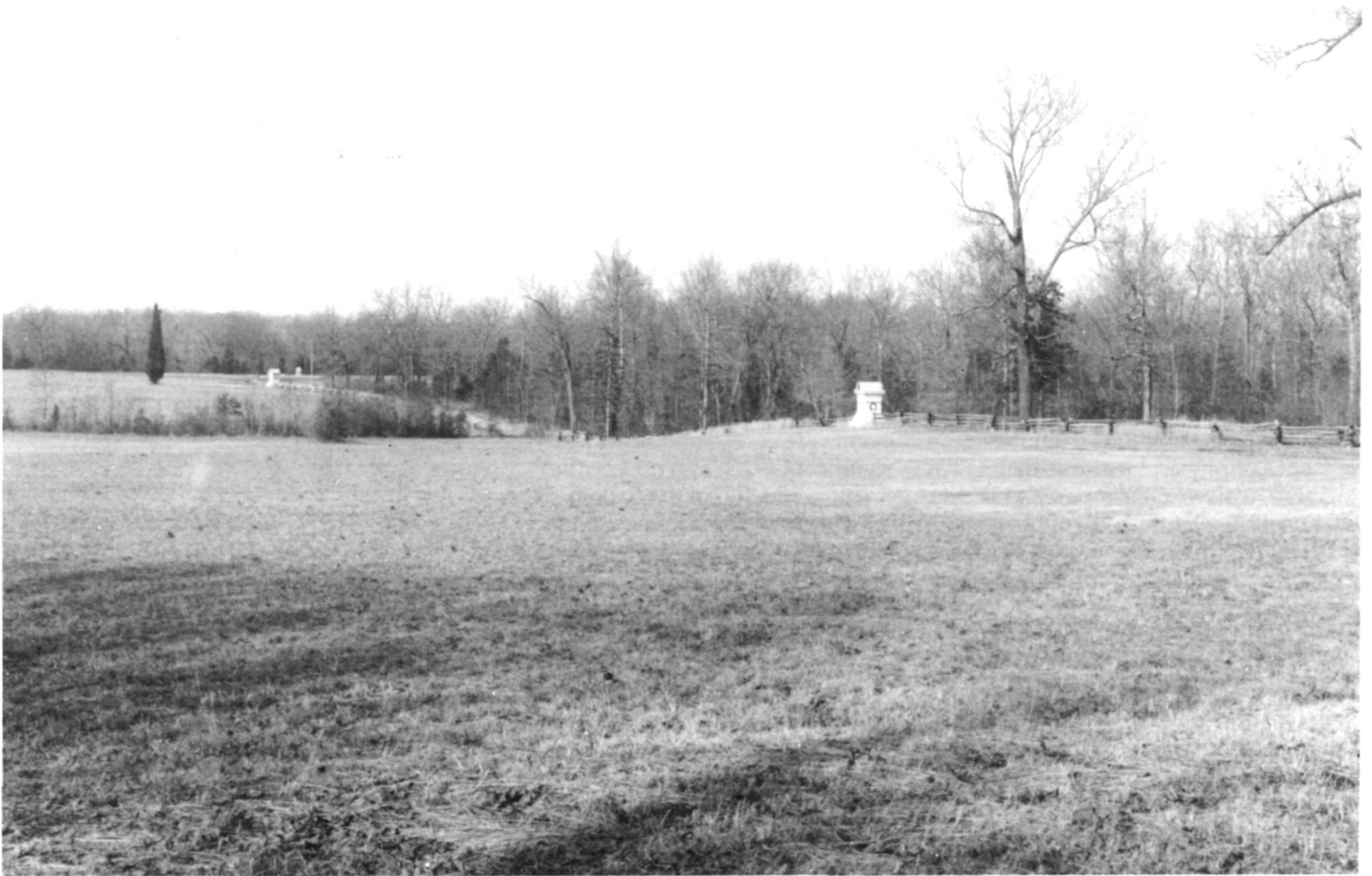
The best-preserved battlefields appear much as they did at the time of the battle, making it easy to understand how strategy and results were shaped by terrain. Participants in the Battle of Shiloh (April 6-7, 1862) would undoubtedly recognize the Sunken Road and the Hornet's Nest depicted here. This was the site of ferocious fighting as Gen. Ulysses S. Grant's men desperately held this position for six hours against eleven Confederate attacks.

reflect the historic use of the land. For example, in battlefields located in rural or agricultural areas, the presence of farm related buildings dating from outside the Period of Significance generally will not destroy the battlefield's integrity. It is important that the land retain its rural or agricultural identity in order for it to convey its Period of Significance. (See following paragraphs on the impact of reforestation). The impact of modern properties on the historic battlefield is also lessened if these properties are located in a dispersed pattern. If a battlefield is characterized by rolling topography, the impact of later noncontributing properties may also be lessened. Frequently, one of the greatest changes to the historic landscape is the development of modern roadways. The changes in the roadway circulation pattern on battlefields should be evaluated for the impact on the battlefield's integrity.