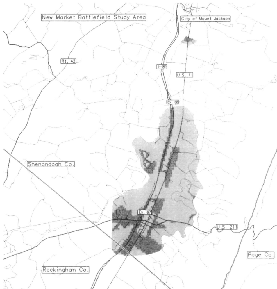
Computerized mapping can aid in evaluating the integrity of battlefields. This digitized map of Second Kernstown Battlefield (Kernstown, Virginia, July 24, 1864) shows areas retaining integrity from the time of the battle (light shaded areas) and areas which have lost integrity since the battle (dark shaded areas). The map overlays information taken from Landsat photographs on current land use, patterns of road networks, and stream formations. (Map by Cultural Resources Geographic Information Systems Facility, National Park Service).

Representative photographs of contributing and noncontributing resources found on the battlefield must be provided with the nomination. Copies of historic photographs, engravings, and illustrations are important documentation for battlefields and should be provided if available.