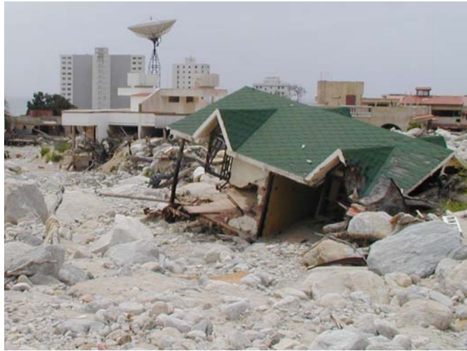
This house was carried and rotated by debris flows in Caraballeda, Vargas, Venezuela, 1999.

The landslides (mostly debris flows) and flash floods along the coastal zone of the state of Vargas and neighboring states in northern Venezuela killed an estimated 19,000 people, caused extensive property damage, and changed hillslope, stream channel, and alluvial fan morphology. Residents had little advance warning of the debris flows and flash floods that struck in the early hours of December 16, so many were caught in their homes and their bodies were carried out to sea or buried by the flood debris.