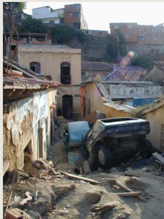
Mud, rocks, and other debris filled streets and houses in La Guaira.