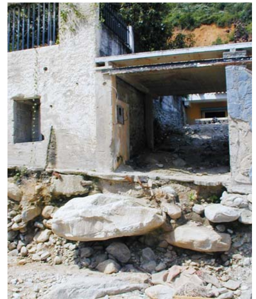
Erosion caused by the 1999 storm exposed the foundation of this house and garage in Caraballeda. The sand, cobbles and boulders upon which the structure rests are an old debris flow deposit.

flash-flood or landslide events per century have occurred in this region since the 17th century. Spanish archives indicate that flash floods and debris flows caused extensive damage to 219 homes and government buildings and destroyed all bridges in La Guaira in February 1798; the floods and debris flows associated with this event were so large that Spanish soldiers placed cannons cross-wise in front of the upstream-facing entrance of a fort to barricade the structure near the stream channel.