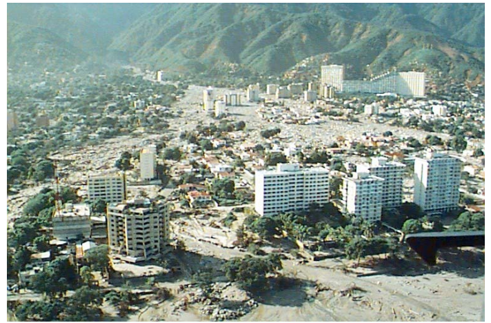
Aerial view of Caraballeda alluvial fan looking south, showing an estimated 1.8 million tons of freshly deposited sediment that was spread across the highly urbanized community by floods and debris flows in December 1999.

flow is last confined by mountain valleys, and then spreads out as sheet flood, debris slurries, or in multiple channels. Flooding is characterized by enough energy to carry coarse sediment even at shallow flow depths. The abrupt deposition of sediment or debris during a flood may substantially alter hydraulic conditions and initiate new, distinct flow paths of uncertain direction. The uncertainty of landslide risk can be heightened by sediment deposition in an alluvial fan channel, resulting in rapid overbank flooding of a channel that was