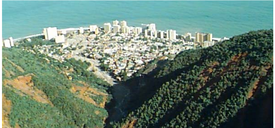
Highly developed alluvial fan, Caraballeda, Venezuela, aerial view looking north.

In December 1999, rainstorms induced thousands of landslides along the Cordillera de la Costa, Vargas, northern Venezuela. Rainfall on December 2-3 totaled 200 millimeters (8 inches) and was followed by a major storm (911 millimeters, or 36 inches) on December 14 through 16. Debris flows and flash floods on alluvial fans inundated coastal communities, caused severe property destruction, and resulted in a death toll estimated at 19,000 people. Because most of the coastal zone in Vargas consists of steep mountain fronts that rise abruptly from the Caribbean Sea, the alluvial fans are the only areas where slopes are not too steep to build. Rebuilding and reoccupation of these areas requires careful determination of potential hazard zones to avoid future loss of life and property.