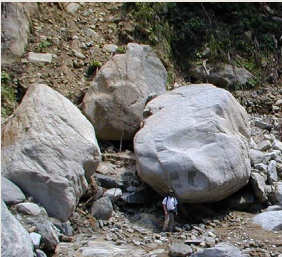
These large boulders, estimated at 300 to 400 tons each, were transported by the December 1999 debris flows near La Guaira.

settlements, the impacts of these types of disasters are likely to increase in the future. Building communities and other infrastructure on alluvial fans has changed high-intensity natural hydrologic processes into major lethal events. As stated by the Secretary General of the United Nations, Kofi Annan, " The term 'natural disaster' has become an increasingly anachronistic misnomer. In reality, human behavior transforms natural hazards into what should really be called unnatural disasters. "