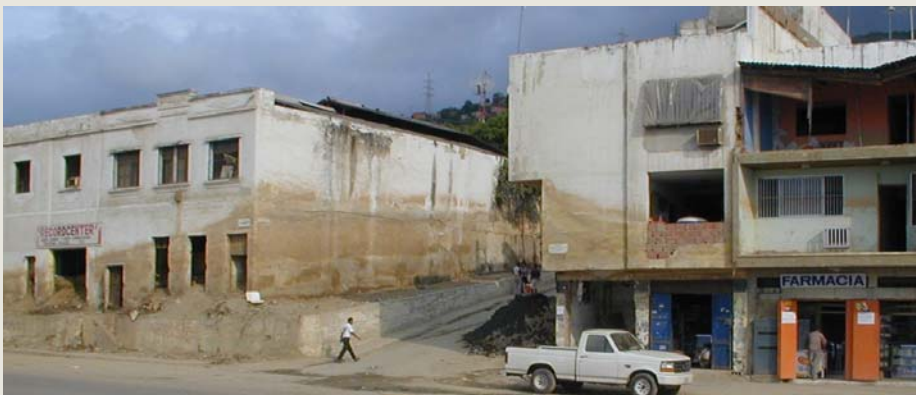
The mudline on these houses shows the height and shape of flood and debris flow deposits. The uphill street served as a conduit for water and debris thereby reducing damage to some of the buildings on this alluvial fan in La Guaira.