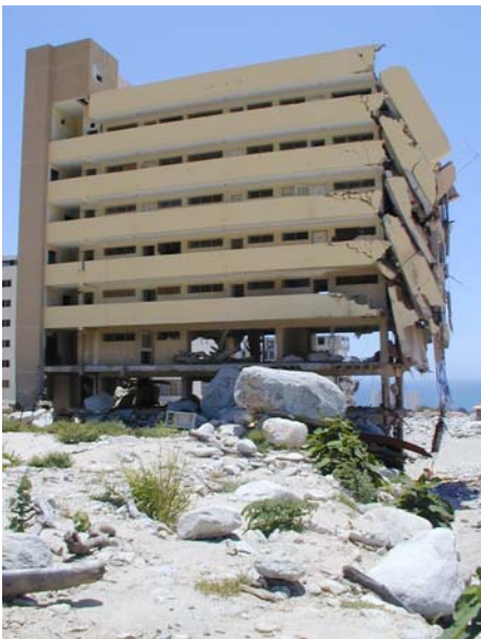
Debris flow damage to apartment building on alluvial fan, Caraballeda, Vargas, Venezuela. Boulders passed through the first two stories of the building.

The rainfall induced thousands of debris flows and other types of landslides in the coastal mountains, and downslope, these landslides coalesced into massive debris flows that moved rapidly through steep narrow canyons and onto the alluvial fans. Residents with homes on the alluvial fans described multiple floods and debris flows that began late on the night of December 15 and continued until the afternoon of December 16.