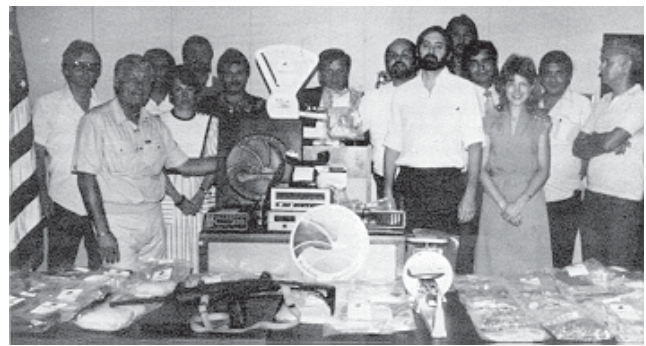
1985: Chicago Division personnel were photographed with the results of raids developed through Operation Durango. The 6-month investigation into the Chicago and Durango, Mexico-based polydrug trafficking group led to the arrest of 120 defendants and the seizure of heroin, cocaine, marijuana and $25 million in assets.

The Anti-Drug Abuse Act of 1986 later provided $44 million to the Bureau of Justice Assistance (BJA) grant program for urban law enforcement agencies, and $1.5 million was made available for the establishment of five Crack Task Forces. By the late 1980s, the DEA’s domestic crack cocaine enforcement activities were conducted through three multi-agency initiatives: DEA Crack Teams, Department of Justice’s BJA Crack Task Forces, and State and Local Task Forces. Cocaine investigations dominated DEA enforcement activities, as cocaine arrests accounted for nearly 65 percent of DEA’s total arrests in 1988. Simultaneously, DEA seizures substantially increased. The DEA had seized only 200 kilos of cocaine in 1977; but the number of seizures jumped to 60,000 kilos by 1988.