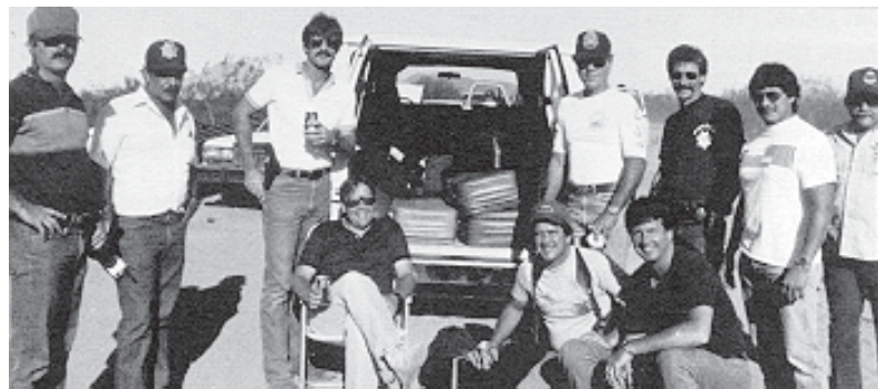
Agents of the DEA's Phoenix Field Division and the Arizona Department of Public Safety (DPS) posed with 700 pounds of cocaine seized in 1987. The seizure, which took place 50 miles south of Phoenix, was the result of a joint DEA, U.S. Customs Service, and Arizona DPS investigation.