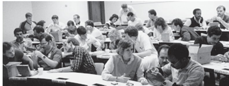
Members of the first basic agent class to train at Quantico are shown learning how narcotics test kits work.

Originally the move was expected to take several months, with new classes not beginning until January 1986, but a special appropriation from Congress was earmarked for agent classes starting in 1985. Consequently, the pace of the move was accelerated and the DEA Office of Training officially moved to Quantico on October 1, 1985.