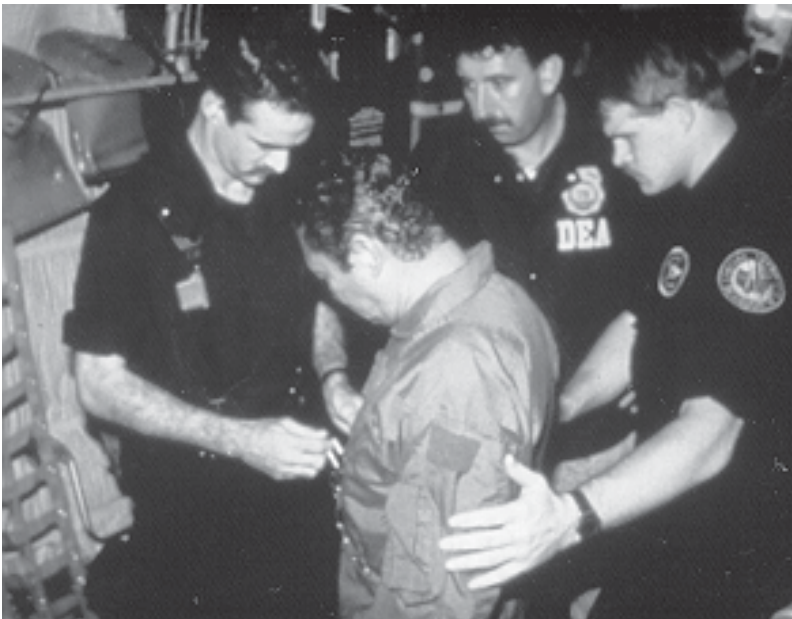
General Manuel Antonio Noriega surrendered to U. S. authorities on January 3, 1990.

On April 6, 1998, he failed to overturn his drug trafficking conviction and the 40-year prison sentence it drew. Noriega’s appeal contended that the drug cartel had paid $1.25 million to a witness to testify falsely against him, and that the government must be held responsible for the alleged bribe. The U.S. Supreme Court, acting without comment, let stand a ruling that said Noriega received a fair trial. The Noriega case was the most notorious drug trial in U.S. history and demonstrated to the American public the global scope of corruption that accompanied international drug smuggling.