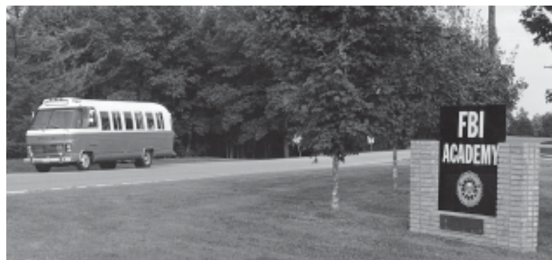
On June 27, 1987, the DEA flag was flown at the FBI Academy in Quantico for the first time. The occasion was the graduation of Basic Agent Training Class 43. The guest speaker was Attorney General Edwin Meese III.