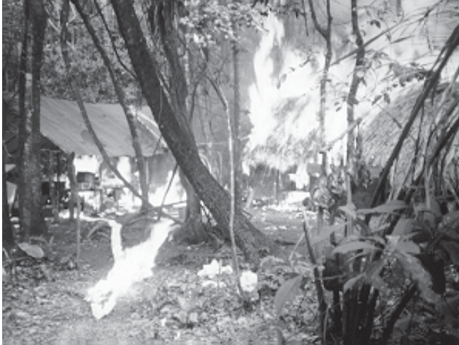
With DEA support, Bolivian troops burned a cocaine conversion lab.

successful programs in the United States. The marine law enforcement operations grew from the DEA's close coordination with the U.S. Coast Guard, while vehicular interdiction originated from the DEA's Operation Pipeline, EPIC's national highway interdiction program.