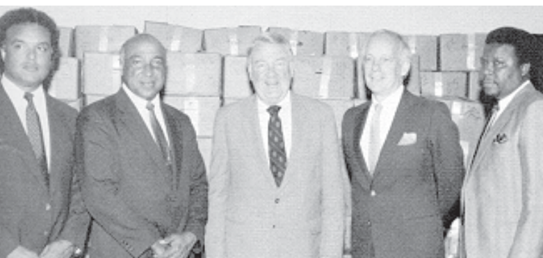
Approximately 5,000 pounds of cocaine, valued at $250 million, were seized in Chicago in July 1987. The cocaine was smuggled in 130 banana boxes. Pictured in front of the seized cocaine are, left to right, Chicago ASAC John T. Peoples; Police Superintendent Fred Rice; Attorney General Edwin Meese III; Chicago SAC Philip V. Fisher; and ASAC Garfield Hammonds, Jr.

The crack epidemic dramatically increased the numbers of Americans addicted to cocaine. In 1985, the number of people who admitted using cocaine on a routine basis increased from 4.2 million to 5.8 million, according to the Department of Health and Human Service’s National Household Survey. Likewise, cocaine-related hospital emergencies continued to increase nationwide during 1985 and 1986. According to DAWN statistics, in 1985, cocaine-related hospital emergencies rose by 12 percent, from 23,500 to 26,300; and in 1986, they increased 110 percent, from 26,300 to 55,200. Between 1984 and 1987, cocaine incidents increased fourfold.