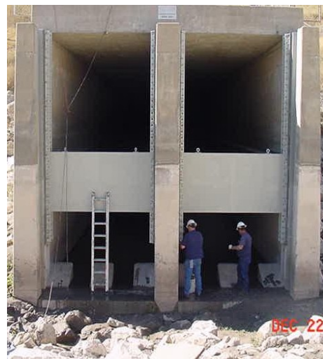
Choke Canyon Dam Flow Deflectors

The first prototype flow deflector was installed in 2002 at Mason Dam in Oregon. After three operational seasons with the flow deflector in place, a dive inspection in June 2005 revealed no signs of abrasion damage and showed that the flow deflector has successfully kept materials from being drawn into the basin. The deflector cost $27,000 to build (uninstalled). Two flow deflectors were installed in 2006 at Choke Canyon Dam in Texas. The flow deflectors were furnished and installed as a component of a large concrete repair project for a total cost of $57,000.