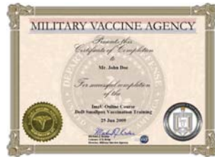
A certificate of completion will be awarded only when all 8 training modules have been completed