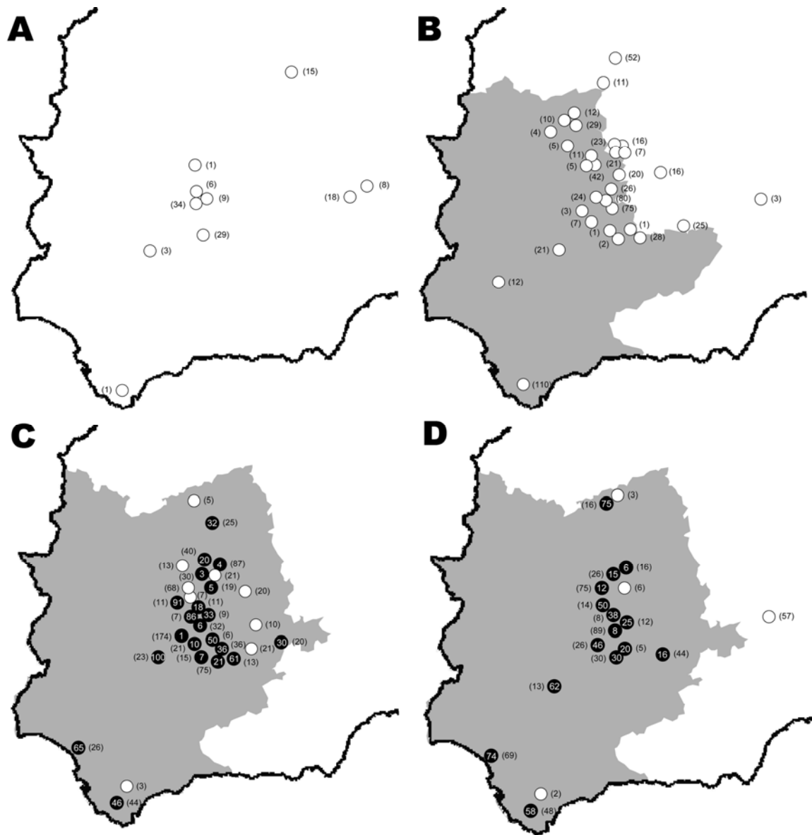
Figure 2. Study areas in Spain showing wild ruminant sampling sites by study year. A) 2003–2004; B) 2004–2005; C) 2005–2006; D) 2006–2007. A year is defined as the period July–June. Animal movement restriction areas for each year ( www.mapa.es ) are shown (gray areas). White dots show wild ruminant seronegative sampling sites, and black dots show level of bluetongue virus seroprevalence in wild ruminants. Numbers of sampled wild animals per sampling site are shown in parentheses.