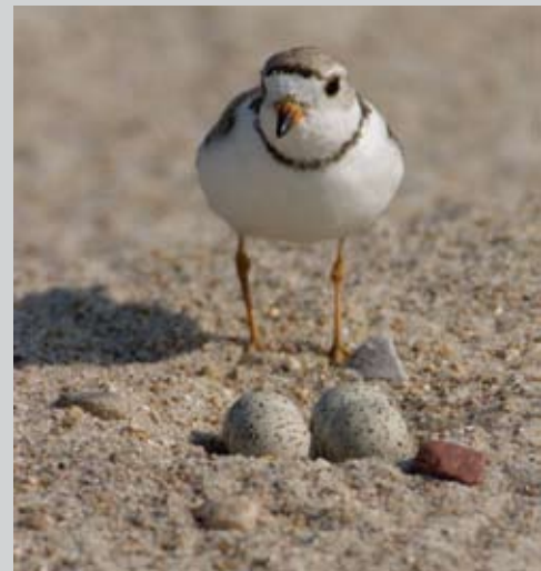
Photo Source: Wayne Hathaway, In Plains Sight. Provided courtesy of the Tern and Plover Conservation Partnership, July 2005.