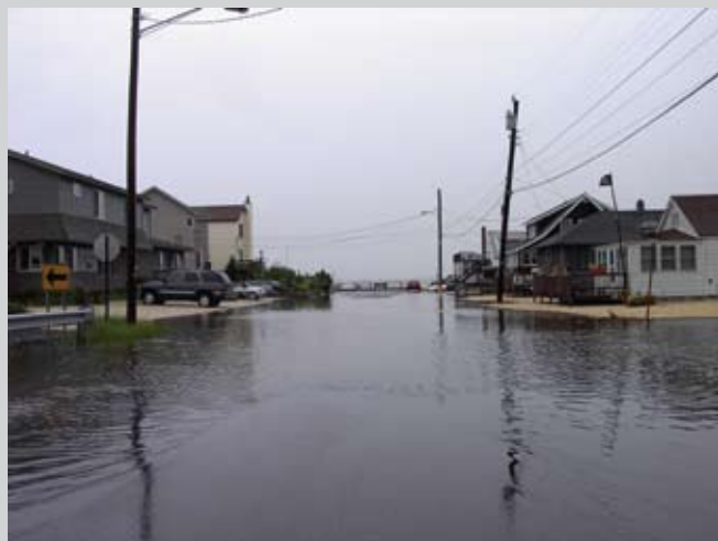
Box Figure A1.2 Spring high tide at Ship Bottom, Long Beach Island, September 1, 2002. Figure 11.4b shows the same area during a minor storm surge.

U.S. EPA’s 1989 Report to Congress used Long Beach Island as a model for analyzing alternative responses to rising sea level, considering four options: a dike around the island, beach nourishment and elevating land and structures, an engineered retreat which would include the creation of new bayside lands as the ocean eroded, and making no effort to maintain the island’s land area (U.S. EPA, 1989; Titus et al. , 1991). Giving up the island was the most expensive option (Weggel et al. , 1989; Titus, 1990). The study concluded that a dike would be the least expensive in the short run, but unacceptable to most residents due to the lost view of the bay and risk of being on a barrier island below sea level (Titus, 1990). In the long run, fostering a landward migration would be the least expensive, but it would unsettle the expectations of bay front property owners and hence require a lead time of a few generations between being enacted and new bayside land actually being created. Thus, the