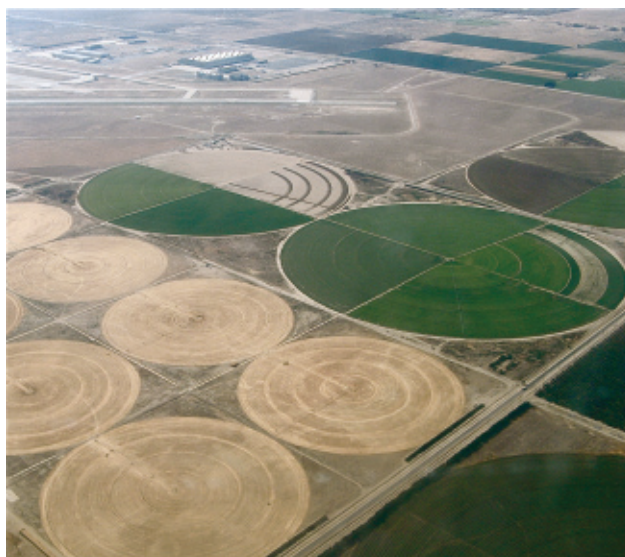
Agricultural practices also affect air quality, such as leaving bare soil exposed to wind erosion, and burning agricultural waste. Photo taken from the NASA DC-8 aircraft during ARCTAS-CARB field experiment in June 2008 over California.