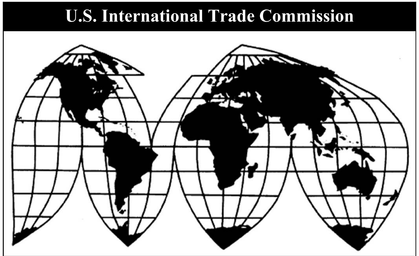
Washington, DC 20436