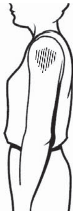
FIGURE 3. Intramuscular site of administration: deltoid

Adapted from Minnesota Department of Health