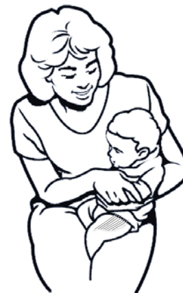
FIGURE 2. Intramuscular/subcutaneous site of administration: anterolateral thigh

Adapted from Minnesota Department of Health