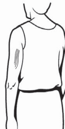
FIGURE 4. Subcutaneous site of administration: triceps

Adapted from Minnesota Department of Health