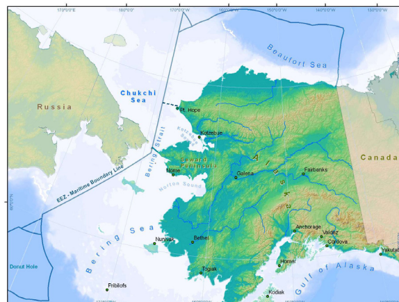
Arctic FMP management area includes EEZ waters off Alaska north of Bering Strait.