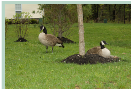
Canada Geese Nesting

Management of Canada goose nesting through destruction of nests and eggs, or through treatment of eggs, can ease damage problems. When geese are aggressively defending nests near doorways, on playgrounds, at schools, and other high-traffic areas, destruction of the nest and eggs along with nesting area habitat modifications can sometimes cause the geese to move elsewhere. Treatment of goose eggs so that they do not hatch will reduce or eliminate the presence of goslings. This will reduce goose feces accumulations and other damage such as overgrazing of lawns and crop depredation. Control of goose nesting will increase the effectiveness of nonlethal methods, especially use of noise-making devices, since adult geese that are not tending to flightless goslings are more inclined to leave an area when they are harassed.