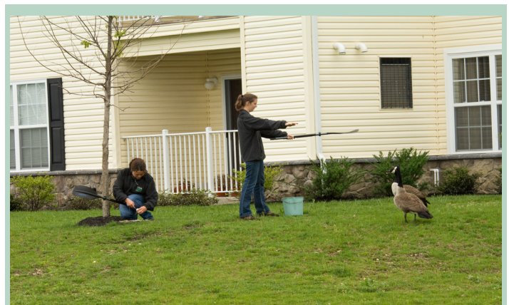
Nest Management is Best Done by a Team of Two People-- One To Treat The Eggs and One To Keep The Geese Away From The Nest

Nest defense behavior by Canada geese is encountered after the nest is located and during the process of moving the adult goose off the nest. Geese must be moved to effectively treat the eggs.