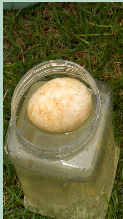
Egg is Floating and is Nearing its Hatching Date

Remove eggs from the water and proceed based on the results. If you intend to oil the eggs, it is recommended that you wipe the eggs dry with an absorbent cloth before oiling or wait until the next day (after the "egg float test") to ensure that the egg is completely dry.