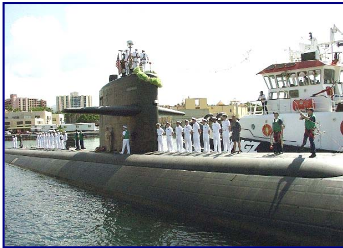
PNS is the lead shipyard for the 688 Class of submarine such as the City of Corpus Christi (SSN 705) shown here.