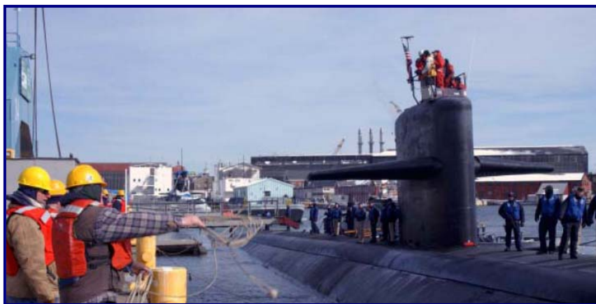
The submarine USS Pittsburgh (SSN 720) at PNS for an engineering overhaul.