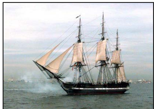
USS Constitution – “Old Ironsides”

Hull was already a hero of the War of 1812 before arriving at Portsmouth. As captain of the U.S. Frigate Constitution , Hull defeated the British in an 1812 naval battle near Boston. When British cannonballs bounced harmlessly off the triumphant Constitution , her cheering crew conferred on her the nickname, Old Ironsides . It was an impressive victory for the fledgling republic, and the American cause was rejuvenated on learning that the Constitution had defeated