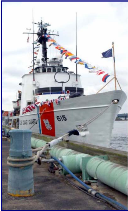
PNS provides homeport support for Coast Guard Cutters.

employers have exceptional management systems and programs that prevent occupational injuries and illnesses. A designated Star site must have had all of its occupational safety and health program elements operating effectively for at least one year, and its injury and accident rates must be below the national average for that industry.