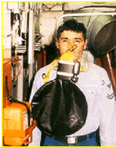
New Respirator for Escape from IDLH Atmospheres

Additionally, NEHC assisted with development of technical specifications and requirements for these respirators and development of shipboard respiratory protection safety procedures in the Naval Ships' Technical Manual . These procedures include direction to Sailors wearing IDLH respirators on entering IDLH spaces, IDLH gas-free engineering procedures, and IDLH rescue procedures. NEHC also developed a two-day respirator course to train top NAVSEA program managers in respiratory protection.