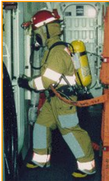
Self Contained Breathing Apparatus for Shipboard Firefighting and Damage Control

For decades the Navy Environmental Health Center (NEHC) has answered respiratory protection inquiries from Navy activities, advised top Navy