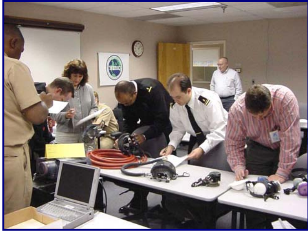
Navy Respirator Course students inspect respirators during the workshop

Most people take the air they breathe for granted, but respiratory protection is