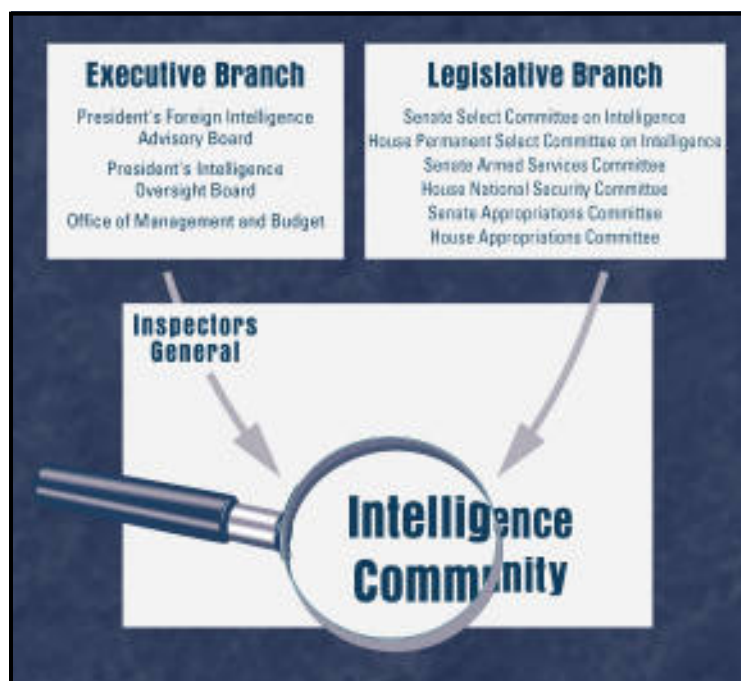
Figure A:3 Intelligence Community Oversight

Each element of the Intelligence Community is subject to the jurisdiction of an Inspector General, either within their own organization or within their parent organization.