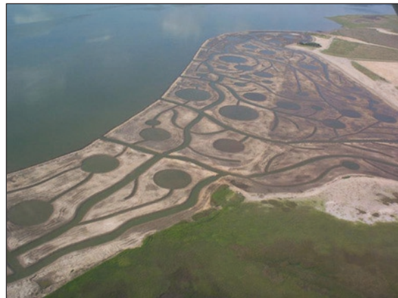
Lavaca Bay/Point Comfort Site, Calhoun County - see case highlights.