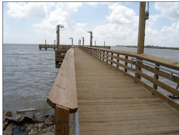
Lavaca Bay/Point Comfort Site, Calhoun County - see case highlights.