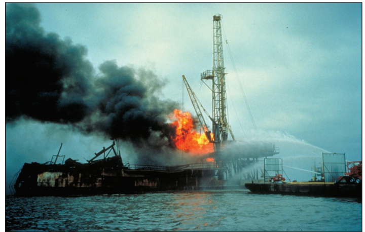
Greenhill, Terrebonne Parish - see case highlights.