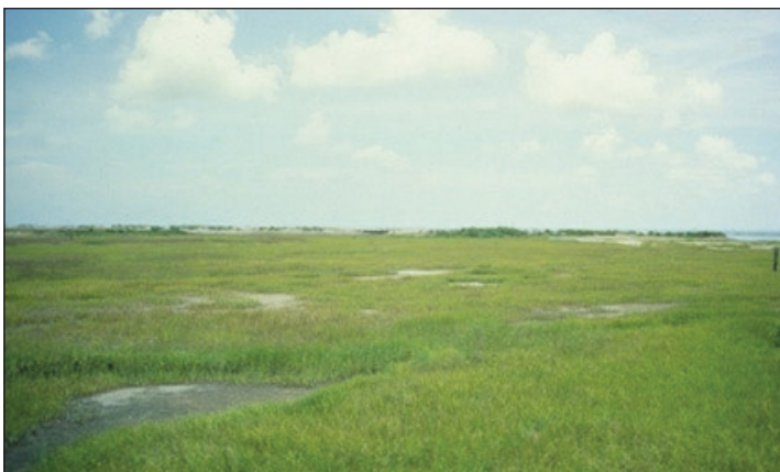
Greenhill, Terrebonne Parish - see case highlights.