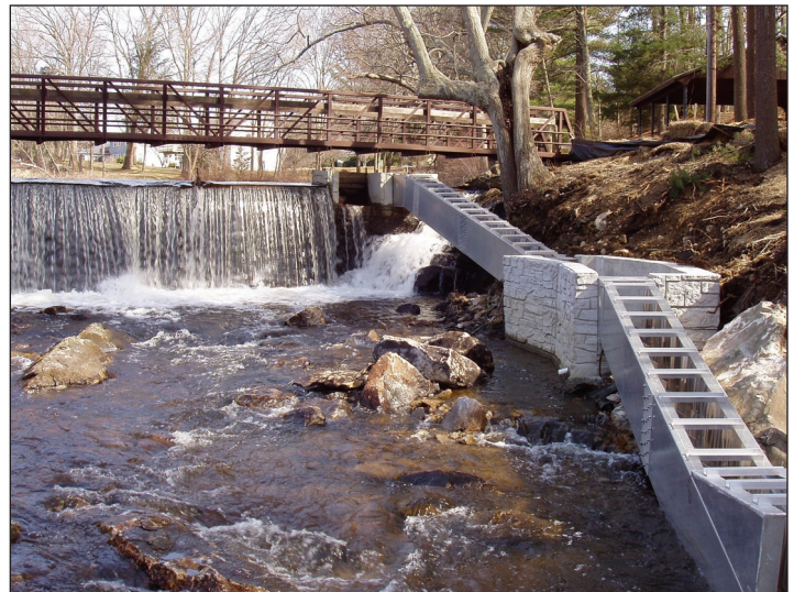
RTC 380 Oil Spill, Long Island Sound, New London - see case highlights.