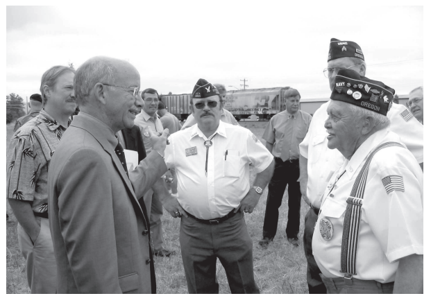
Rep. DeFazio talks with veterans at the Lane County Armory Groundbreaking last summer.