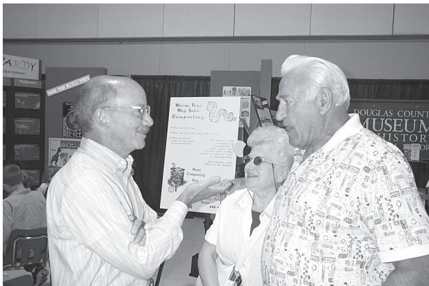
Rep. DeFazio talks with seniors about Social Security and other important issues during a recent visit to Douglas County.

The privatization commission alleges that Social Security will go bankrupt in 2016. They assume that the federal government will not, as required by law, put its full faith and credit behind the Trust Fund, or continue to pay interest on those funds. That's simply not true. The commission makes these false claims in order to generate support for their own privatization proposals, despite their shortcomings (see p. 3).