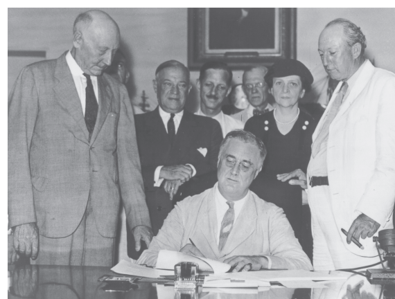
In 1935, President Franklin Roosevelt signed Social Security into law. Today, the program is facing financial challenges.

Retired workers and their families rely on Social Security for most of their income. Average middle-income older Americans receive 66 percent of their retirement income from Social Security, only 15 percent from private pensions, and just 10 percent from savings.