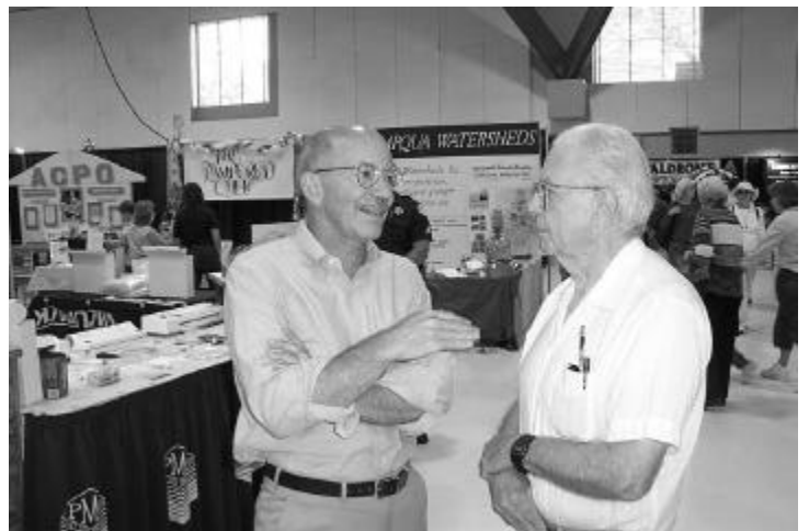
DeFazio spoke to Oregonians at the Douglas County Fair about the rising cost of prescription drugs.

Canadians pay, on average, 40 percent less than Americans for the same prescription drugs. Prescription drug prices, the biggest factor in increasing health care costs, are rising two to