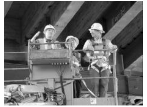
Oregon needs federal assistance to repair its crumbling infrastructure like this failing I-5 bridge which DeFazio is inspecting with ODOT workers.

Last year, I authored the “Water Quality Financing Act,” to invest $20 billion in rebuilding and updating deteriorating water systems in towns like Albany, Lakeside, and Port Orford. I also support legislation to allocate billions of dollars for road and bridge maintenance, high-speed rail, and school construction, among other public works programs. As a senior member of the House Transportation and Infrastructure Committee, it is clear that repairing our crumbling infrastructure will help put Oregonians to work in the short-term and improve pros-