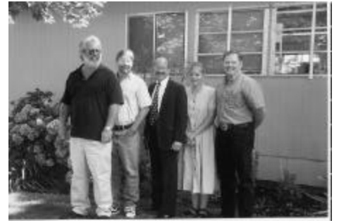
Peter DeFazio meets with scholarship recipients to discuss federal support for education.

I plan to introduce legislation which, if Congress decides to give itself a pay raise, would link the salary increase to the Social Security COLA. Members of Congress should be willing to make a shared-sacrifice to balance the budget.