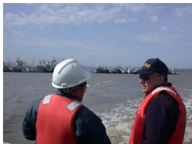
MARAD and NOAA officials during the April tour of the Reserve Fleet

N OAA's Office of Response and Restoration is investigating environmental contaminants in and around the National Reserve Fleet in Suisun Bay, California. More than 70 obsolete or decommissioned vessels make up the fleet, which is maintained by the United States Maritime Administration (MARAD). The State of California and various environmental groups raised