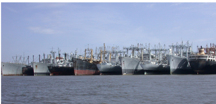
Seven rafts of ships similar to this one make up the Reserve Fleet