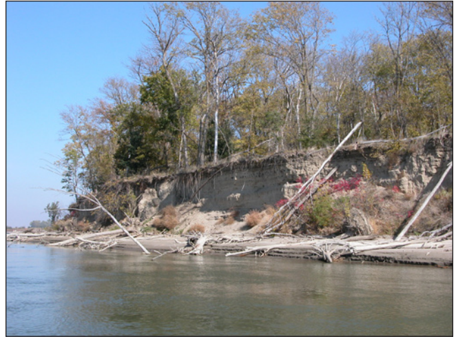
Figure 2: A geomorphic classification system will aid in understanding why and where bank instability occurs in the Missouri National Recreational River.

http://infolink.cr.usgs.gov/RSB/Hab/index.htm