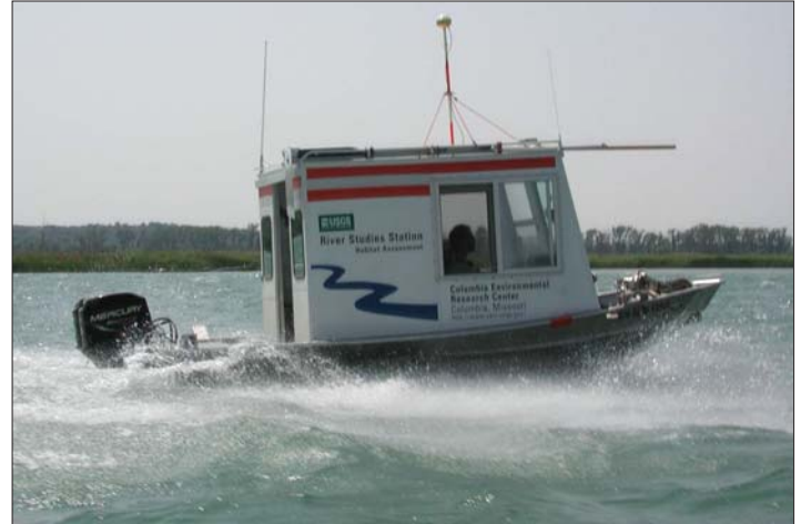
The U.S. Geological Survey's Missouri River habitat assessment research vessel John L. Funk.

Beginning in the early 1800's and continuing to the present, the channel of the lower Missouri River (downstream from Sioux City, Iowa) has been trained into a fast, deep, single-thread channel. Wing dikes now concentrate the flow and revetments and levees keep the channel in place and disconnect it from the floodplain. In addition, reservoir regulation of the Missouri River has substantially changed the annual hydrograph, sediment loads, temperature regime, and nutrient budgets.