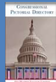
Congressional Pictorial Directory: 111th Congress

http://www.america.gov/publication/ajournalusa/0708.html