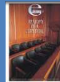
Anatomy of a Jury Trial

http://csis.org/files/publication/hf_v17_03.pdf