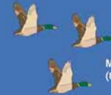
Migrating Ducks and Geese (8,000-9,000 ft / 2,500-2,800m)