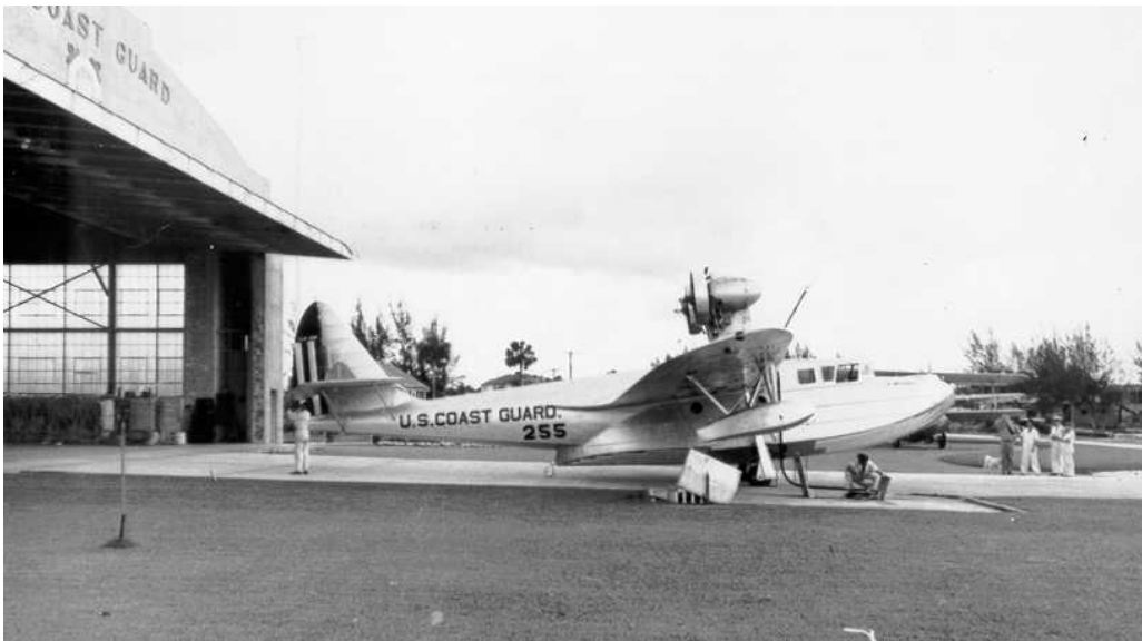
Fokker PJ-1, Coast Guard No. 255, at Air Station Miami. This is the type of seaplane flown by LCDR Leamy on the rescue described in this article. These aircraft were built specifically for the Coast Guard. They were known in the service as FLB's or Flying Life Boats.

As his plane roars out through the harbor entrance, Commander Leamy finds it---thick cottony fog that shuts off vision as effectively as if the windows of the plane had been painted white.