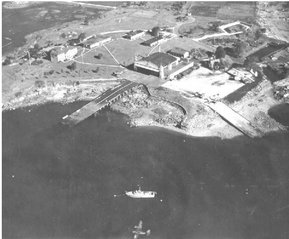
Another overhead view taken in 1945. Note the ASR "crash" boat and the Grumman JRF "Goose" in the foreground.