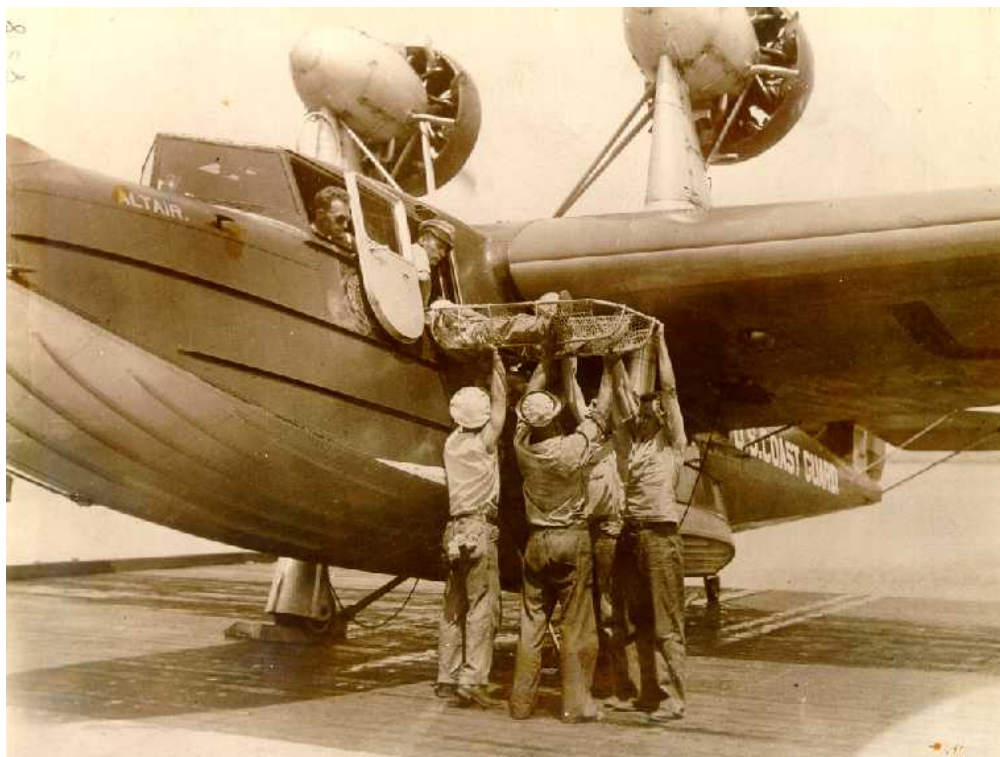
Shown here is an example of the stretcher, as mentioned in the article, in use during another rescue. It was designed by an enlisted Coast Guardsman.

One night the station got a call from the liner City of Baltimore , Norfolk bound with a load of refugees, evacuated from revolution torn Spain by the Coast Guard Cutter Cayuga . One of the passengers, a woman, was critically ill, and needed immediate hospital treatment.