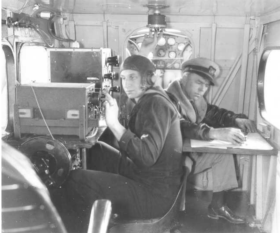
The radio direction finding equipment used to locate vessels in distress as described in this article. Note the operator adjusting the direction-finding antenna on the roof of the cabin as he attempts to locate the direction of an incoming radio signal.