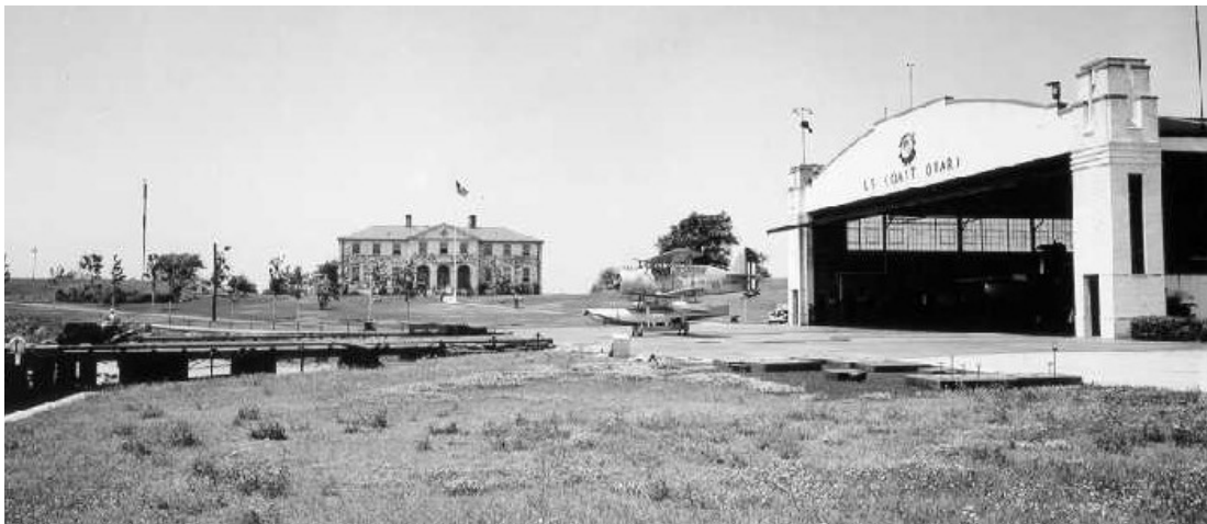
U.S. Coast Guard Air Station Salem, circa 1938. Note the Fokker-General Aviation PJ-1 in the hanger and the Curtiss SOC-4 Seagull on the flight line. The station was originally commissioned in February, 1935 and remained in service until the fall of 1970.

Unknown author, circa 1937 Coast Guard Magazine Volume 10, Number 6 (April, 1937), pp. 3, 30-31.