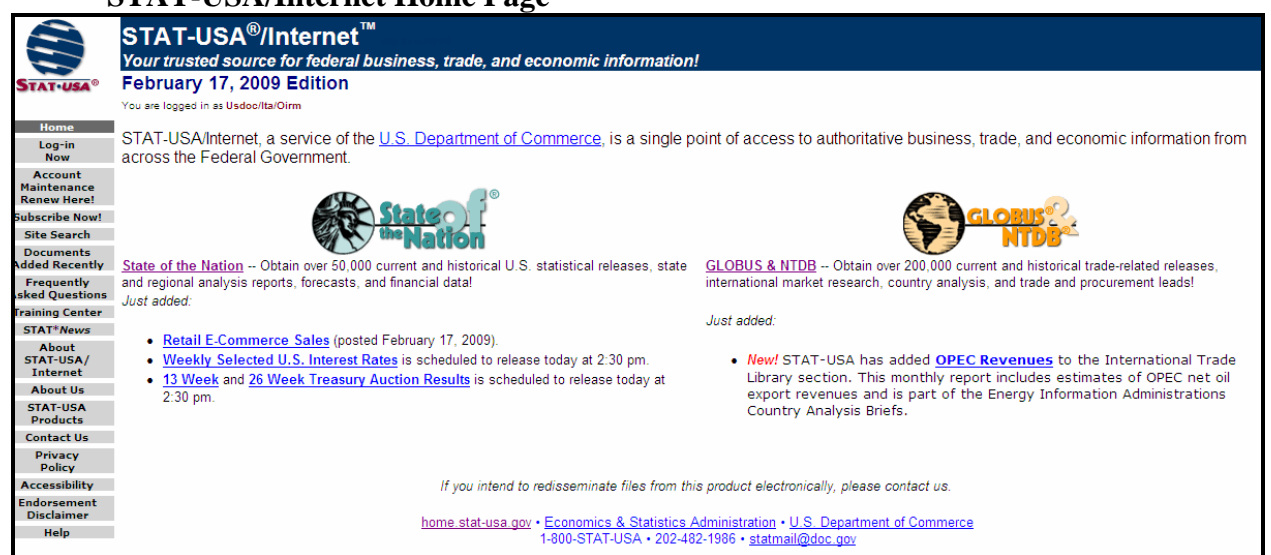
Figure 1: STAT-USA/Internet Home Page

State of the Nation<sup>®</sup> (SOTN): This section tracks the direction of the U.S. economy and provides a repository for statistical releases of economic indicators from a number of federal agencies, including the U.S. Census Bureau, Bureau of Economic Analysis, Bureau of Labor Statistics, Federal Reserve Board, Department of Treasury, and Federal Reserve System banks. Information provided in SOTN includes current and historical economic news/releases, economic indicators, and topical areas including employment and economic policy, and restricted releases. The main SOTN page is located at <a href="http://www.stat-usa.gov/sotn">http://www.stat-usa.gov/sotn</a>.