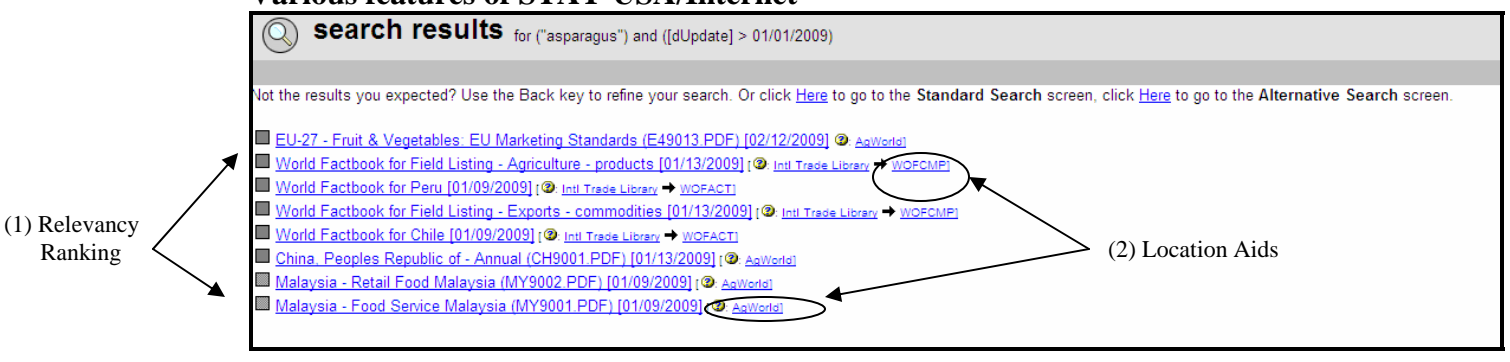
Figure 4: Various features of STAT-USA/Internet