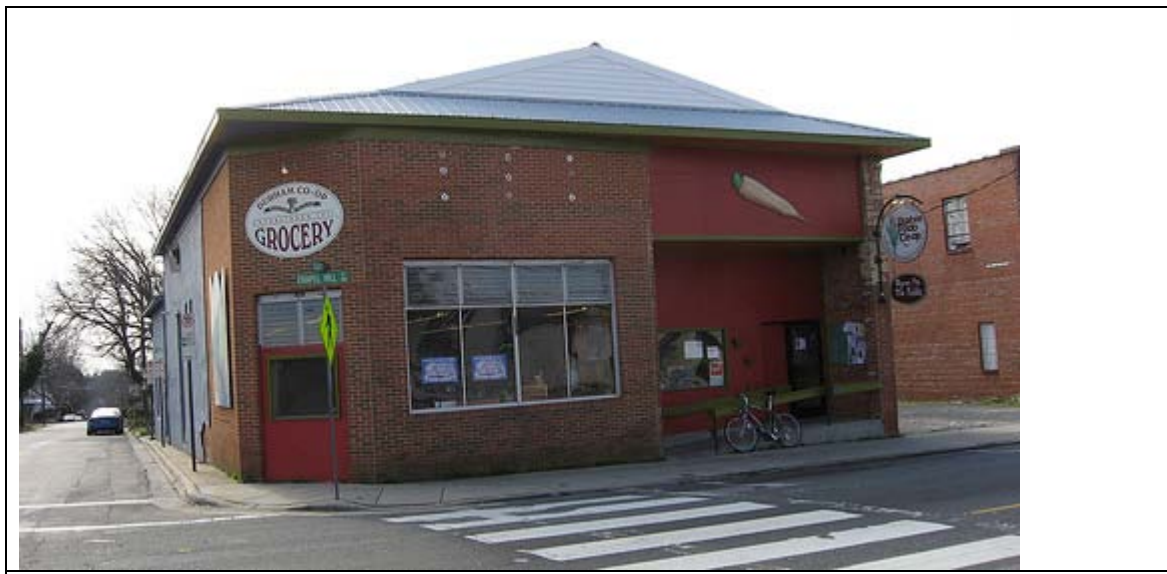
Durham Food Co-op