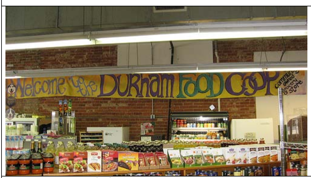
Inside the Durham Food Co-Op