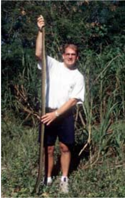
Figure 1— Adult brown tree snakes can often grow longer than a person is tall.