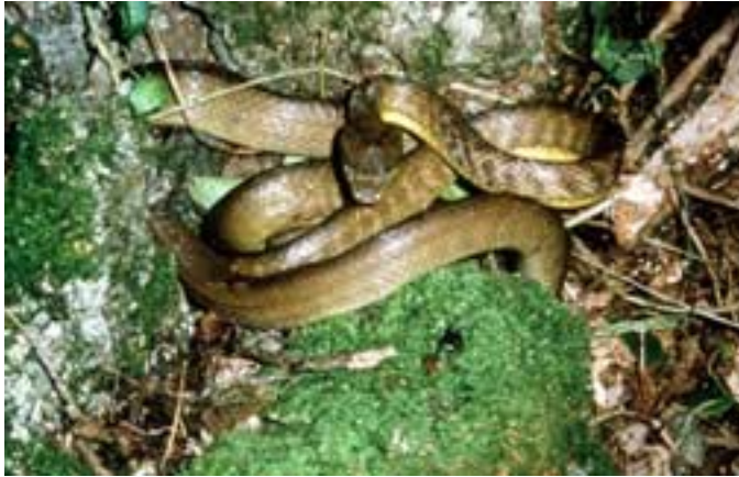
Figure 5 —Nobody wants an angry snake leaping out of a cargo box. Inspect all items leaving the island and prevent the escape of the brown tree snake.

A brown tree snake can be captured by pinning it down with a broom, golf club, or garden tool. If necessary, grab the snake directly behind the head. A blow to the snake's head with a heavy object or boot heel will be fatal.