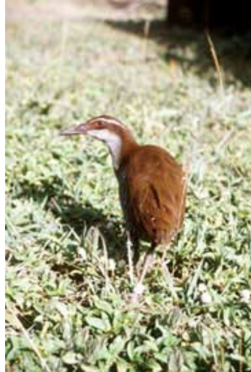
Figure 4— The brown tree snake has hunted the Guam rail almost to the point of extinction.

The Guam Division of Aquatic and Wildlife Resources, in cooperation with several zoos of the American Association of Zoological Parks and Aquariums, has established captive breeding programs for the endemic Guam rail ( Rallus owstoni ) (fig. 4), Micronesian kingfisher ( Halcyon cinnamomina cinnamomina ), and the Mariana crow ( Corvus kubaryi ). The remaining wild Mariana crows on Guam are monitored, and their nests are protected from brown tree snakes. Several