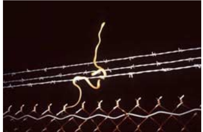
Figure 2— Though brown tree snakes cannot “leap tall buildings at a single bound,” they can climb impressively.

Brown tree snakes are excellent climbers. The fact that they can support their weight with their tail enables them to stretch both upward and sideways (fig. 2). The snakes can also coil their flexible bodies and hide in extremely confined spaces. Although most brown tree snakes live in trees in forest and scrub habitat, these snakes can be found almost anywhere.