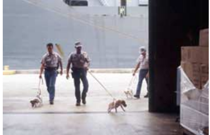
Figure 3 —Jack Russell terriers are used to sniff out snakes trying to hitch a ride off the island.

Wildlife Services (WS), a part of the U.S. Department of Agriculture's (USDA) Animal and Plant Health Inspection Service (APHIS), conducts operations on Guam aimed at keeping brown tree snakes from reaching other destinations. Two methods WS uses are snake trapping and nighttime spotlight searches to reduce the number of snakes in areas where cargo is packed or stored. Specially trained Jack Russell terriers are employed to detect any brown tree snakes that may have hidden in outgoing cargo (fig. 3). Educational materials, such as videos, brochures, and dog demonstrations, are used to raise the awareness of outbound cargo handlers about snake-control issues.