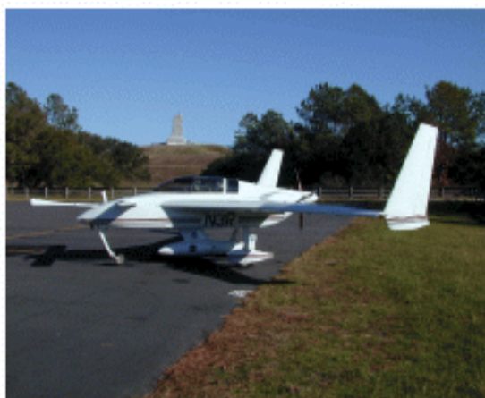
N3R at the First Flight Airport for SHOWEX-99

Existing models for surface wind stress in the shoaling zone fail because of their inability to account for wave age, shoaling, and internal boundary layer development. The fetch-dependent wave field in this region cannot be adequately studied without information on the spatial variation of the mean wind and surface stress fields. This can only be accomplished with a low-flying research aircraft equipped with turbulence monitoring sensors. The primary objective of SHOWEX was to measure the spatial variation of the mean wind, surface stress, and spectral wave fields in the shoaling zone. A second objective was to study the spatially varying mean wind, surface stress, and wave fields to model the effects of wave age, shoaling, and internal boundary layer development on the drag coefficient and momentum transfer between waves and the atmosphere. Further details can be found at http://cheyenne.rsmas.miami.edu/showex/showex.htm .