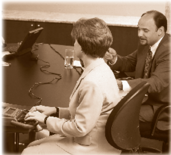
Some captioners work in business settings.

Among the sources to look for from BLS are the 2006-07 print editions of the Occupational Outlook Handbook and the Career Guide to Industries . The Handbook describes the duties, earnings, training, and employment outlook for hundreds of occupations, including court reporters; the Career Guide describes dozens of industries with similar detail. Both are also available online—the Handbook at www.bls.gov/oco and the Career