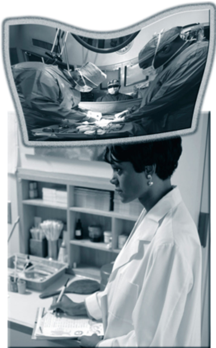
TV dramas focus on action, often overlooking routine job tasks like paperwork.

discharge specialists—would normally do.”