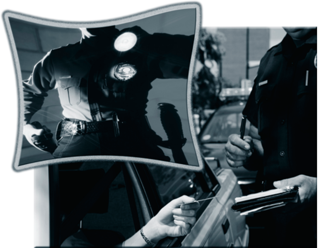
Police work is more than the tough-as-nails image that television sometimes portrays.

case at a time until it is resolved—by the end of the episode—these workers in real life have little autonomy and might work diligently for years on several cases, without a breakthrough. “Crimes are typically extremely complex and difficult to solve,” Townsend says. “Many don’t get solved.”