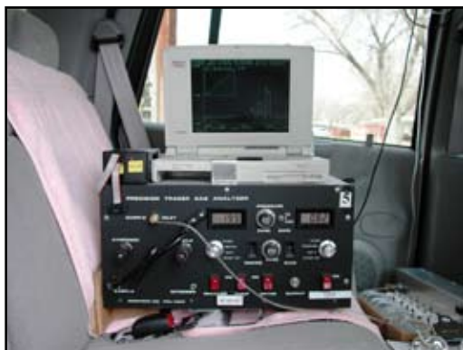
A fast response analyzer that measures tracer concentrations every second. The analyzer is easily carried in the back seat of a vehicle.

The \text{SF}_6 analyzers include a computer controlled calibration system and an integrated global positioning system (GPS) that tags each data point with sampling time and location. The systems can be used in cars, boats, aircraft, and buildings. The current configuration easily sits in an automobile or aircraft passenger seat and attaches with standard seat belts.