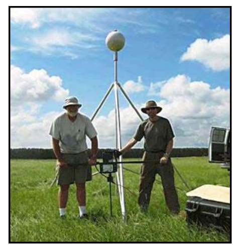
NOAA scientists setting a ground anchor for an ET Probe deployed in advance of Hurricane Ivan.