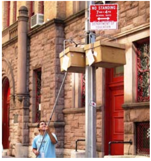
Deploying a tracer sampler in New York City.

Meteorological Instrumentation and Mesonets FRD has decades of experience designing, developing and deploying both permanent and temporary meteorological instrumentation, as well as establishing and operating mesonets (networks of meteorological monitoring towers