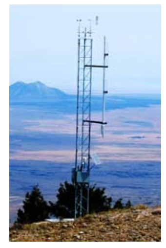
Meteorological tower on the summit of Big Southern Butte. INL mesonet, Photo: NOAA

FRD is a pioneer in atmospheric tracer experiments, which date back to the 1960s. Tracer experiments involve the controlled release of a non-toxic gas at low concentrations and the subsequent tracking and measurement of the gas as it is transported and dispersed by the atmosphere. This "tracer" mimics the dispersion characteristics of an actual toxic gas release, thereby permitting evaluation of toxic gas dispersion models. FRD's most recent focus is on conducting tracer studies to understand wind flows in cities. This is important, for example, to national security if a toxic gas should be released during a terrorist event. Additionally, these tracer studies help air quality regulatory agencies understand dispersion of vehicle emitted pollution into neighborhoods near high-traffic roadways.